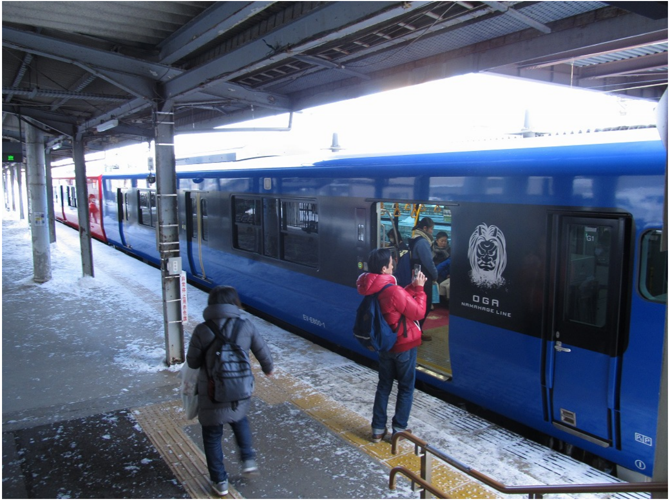
a train of Oga line