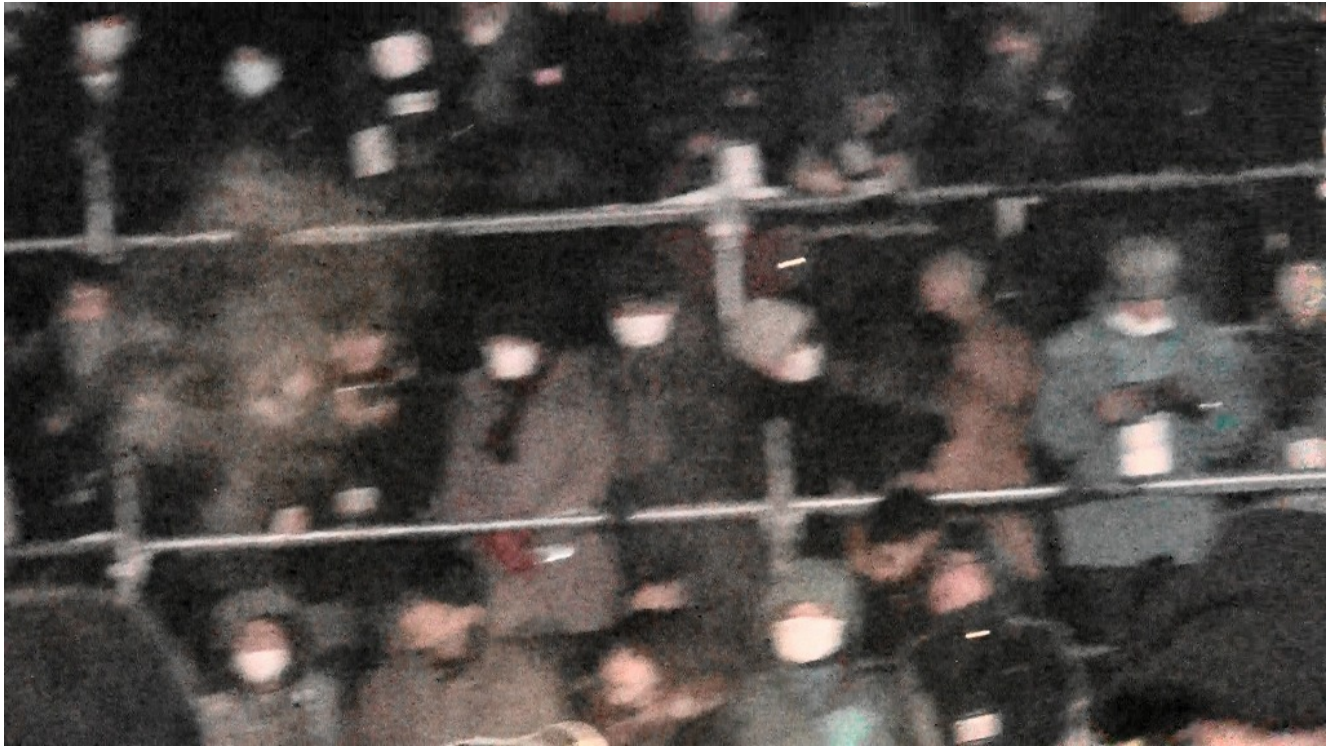
staircase type stands