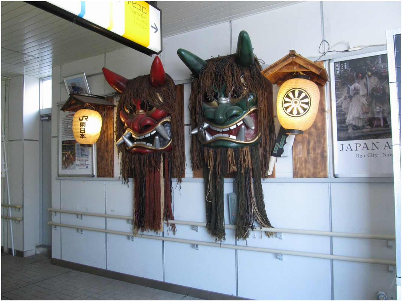
entrance to Oga line