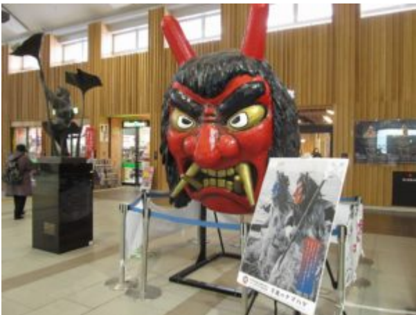
Namahage face in Akita station

□Akita station has a shopping center. You can look for sops to eat foods and keep yourself warm. And you may be surprised to find many goods of Namahage, not only in the the souvenir shops but all over the town. We can know that Namahage in Oga region only but it is an important tourist attraction for all Akita.