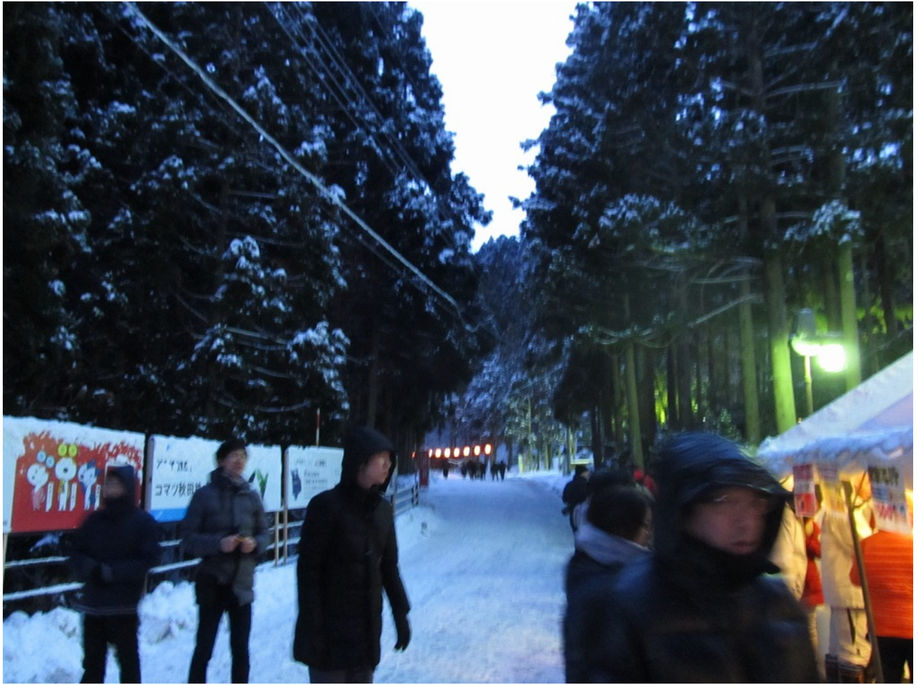
road to shrine