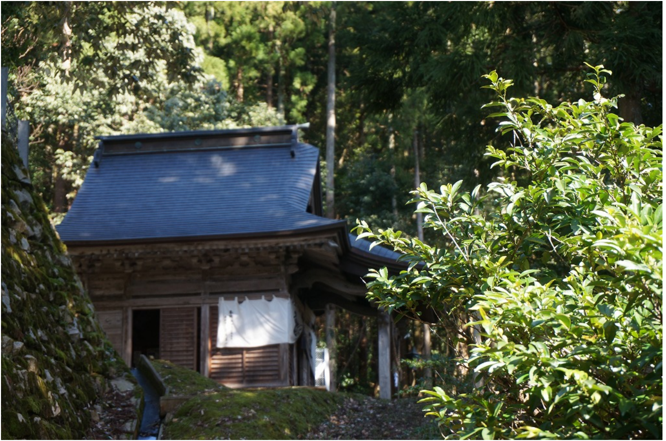
The Hakusan shrine□□□□

□I wonder, if I run some 2~30 minutes, I might finally arrive at the destination. It is the “Senko-ji temple”. There are steps for the “Kannon-do hall” right next to the building.