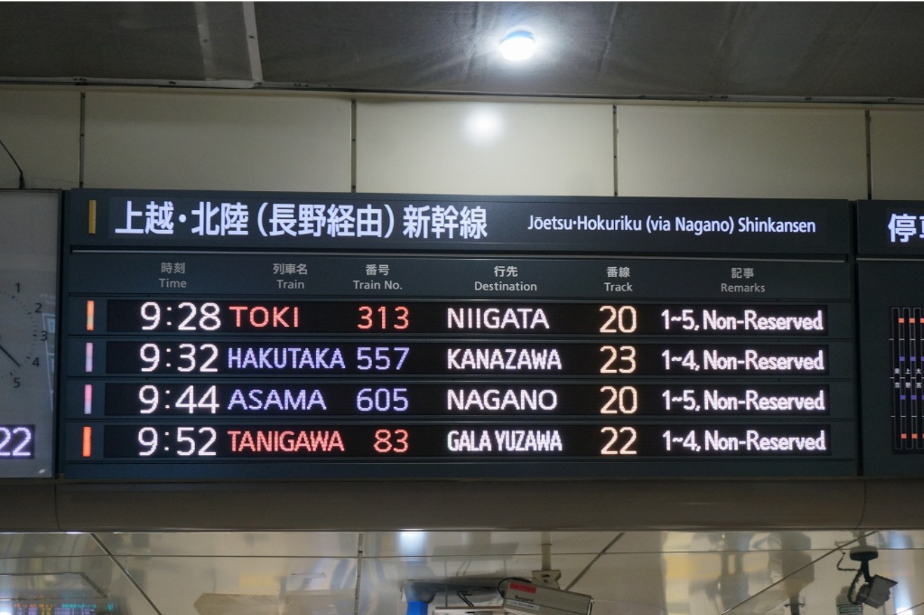
Tokyo station 〇〇〇