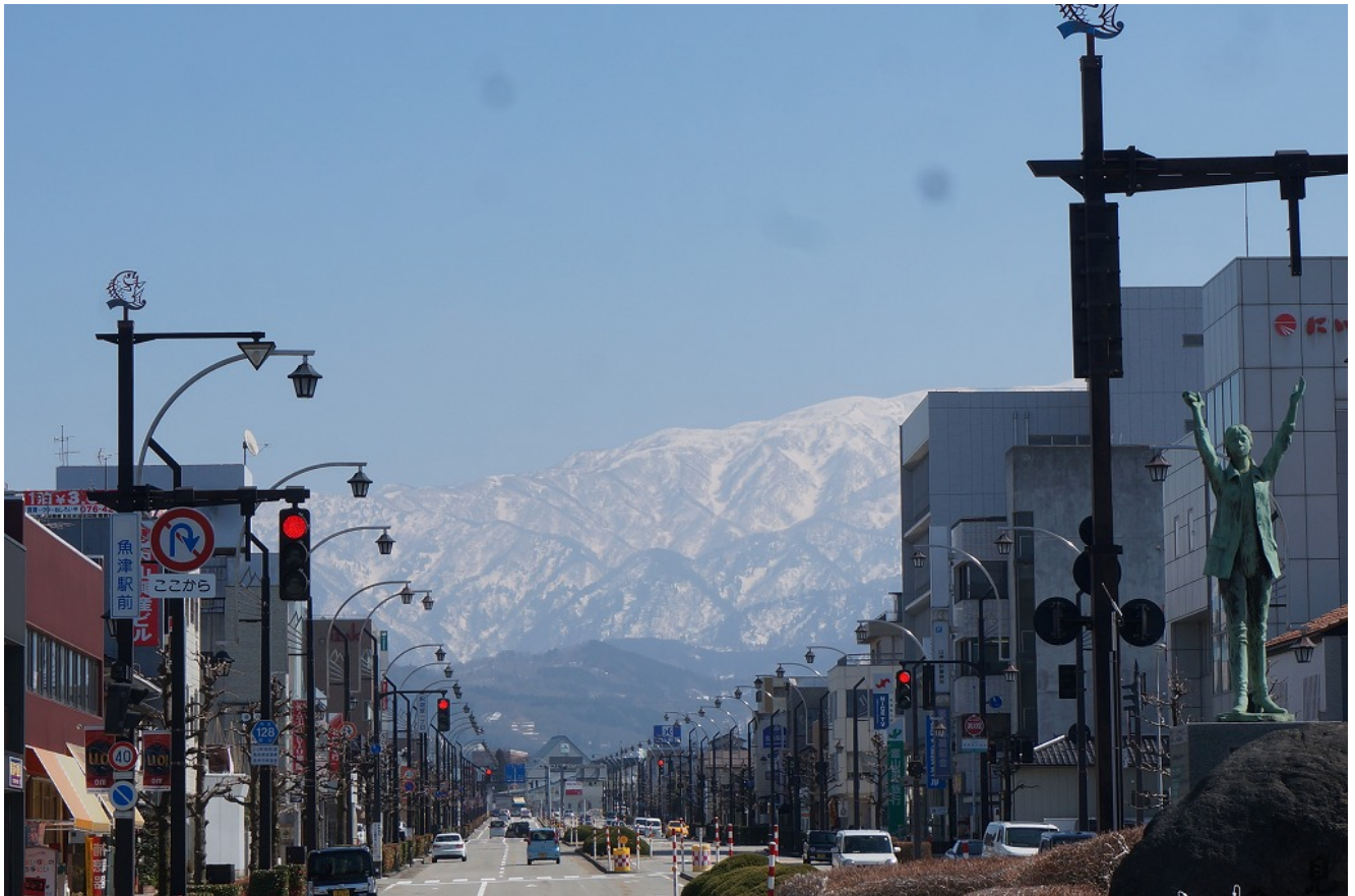
Uozu city and Tateyama mountain range