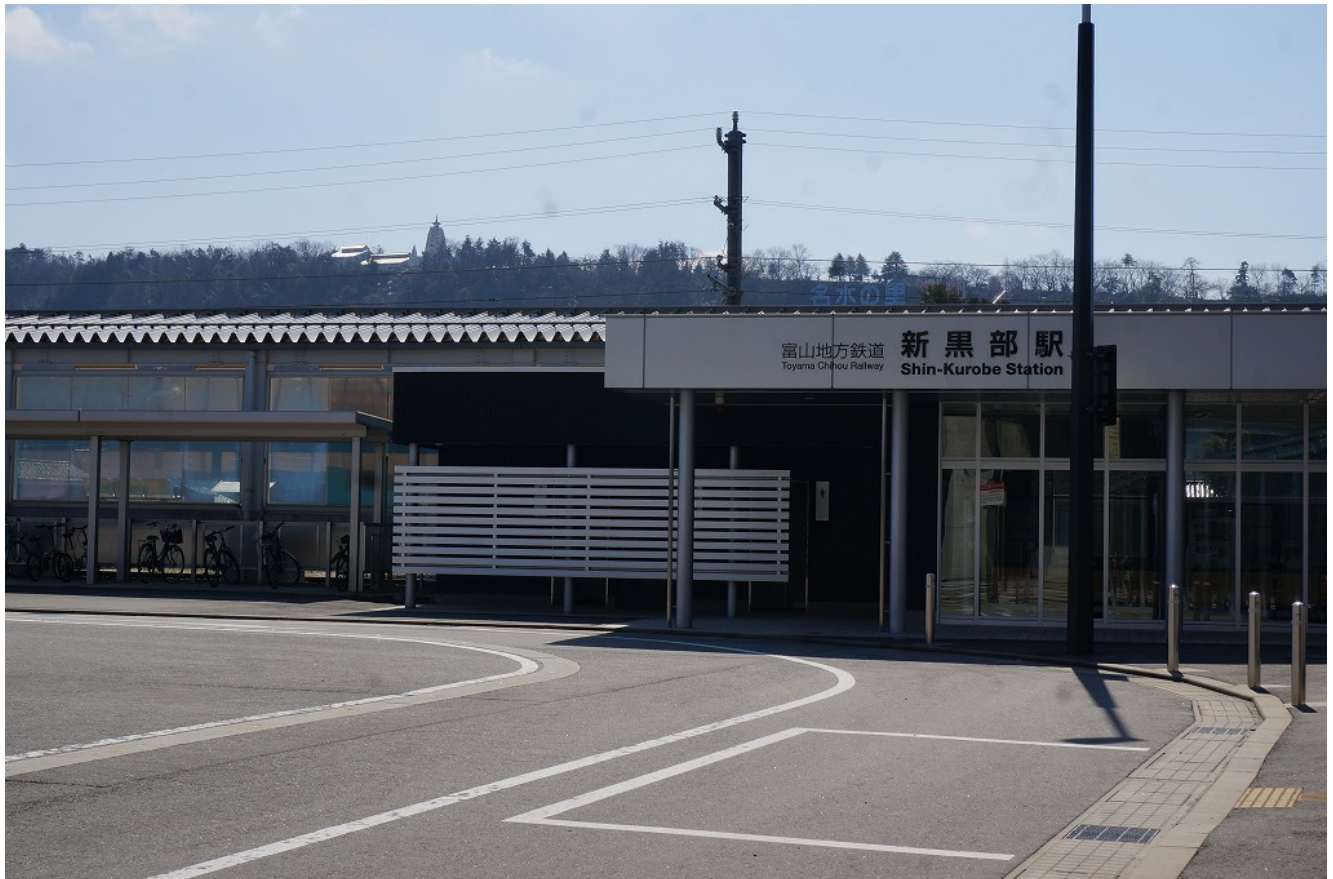
Shin Kurobe station 新黒部駅 is front of Kurobe Unzauki Onsen