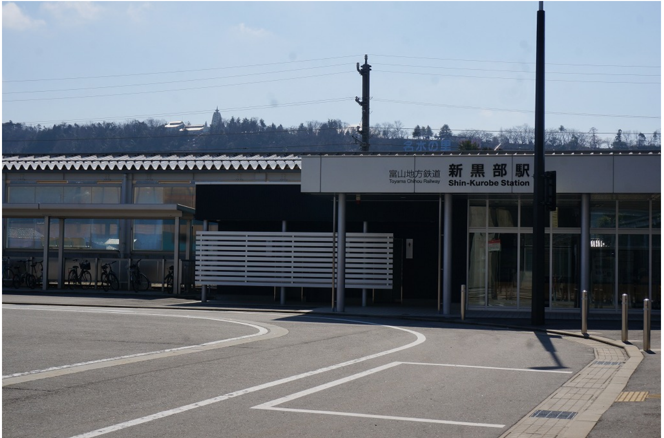
Shin Kurobe station 新黒部駅 is front of Kurobe Unzauki Onsen