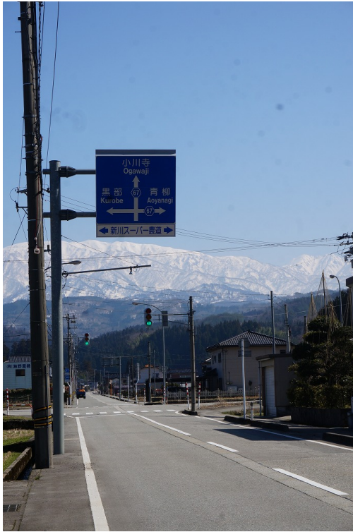
a road to Ogawaji

□It's very fine, but the air is cold and feel chilly. Is this because it was still March or because this was Toyama? I was comfortable cycling, while seeing the snowy Tateyama mountain range. The city is very calm.