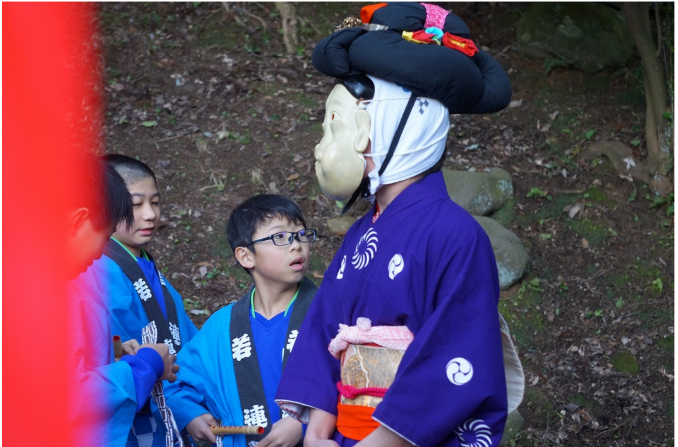
anema-men (mask) □□□□