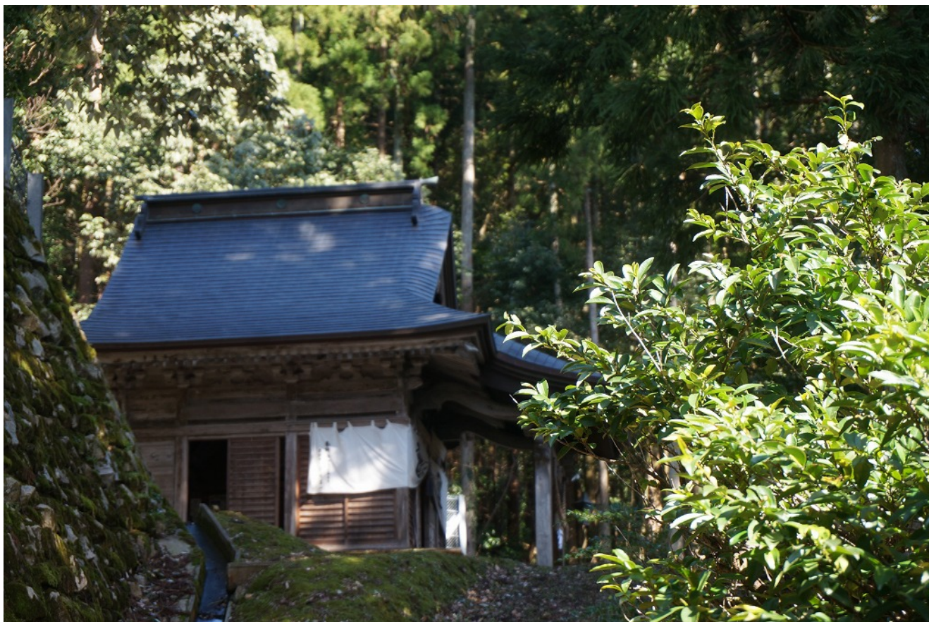
The Hakusan shrine□□□□

□I wonder, if I run some 2~30 minutes, I might finally arrive at the destination. It is the “Senko-ji temple”. There are steps for the “Kannon-do hall” right next to the building.