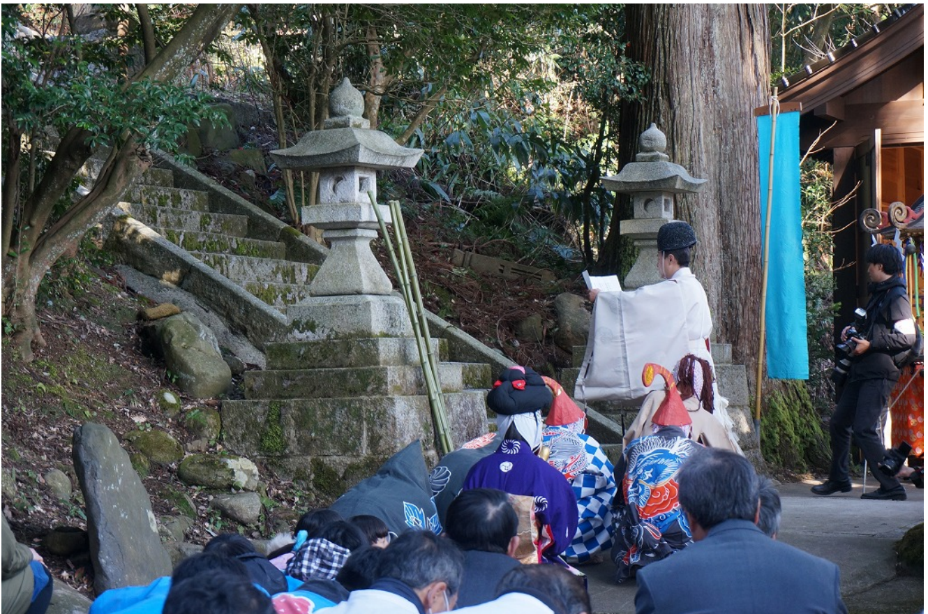
□I looked at some strange people who come up the stairs