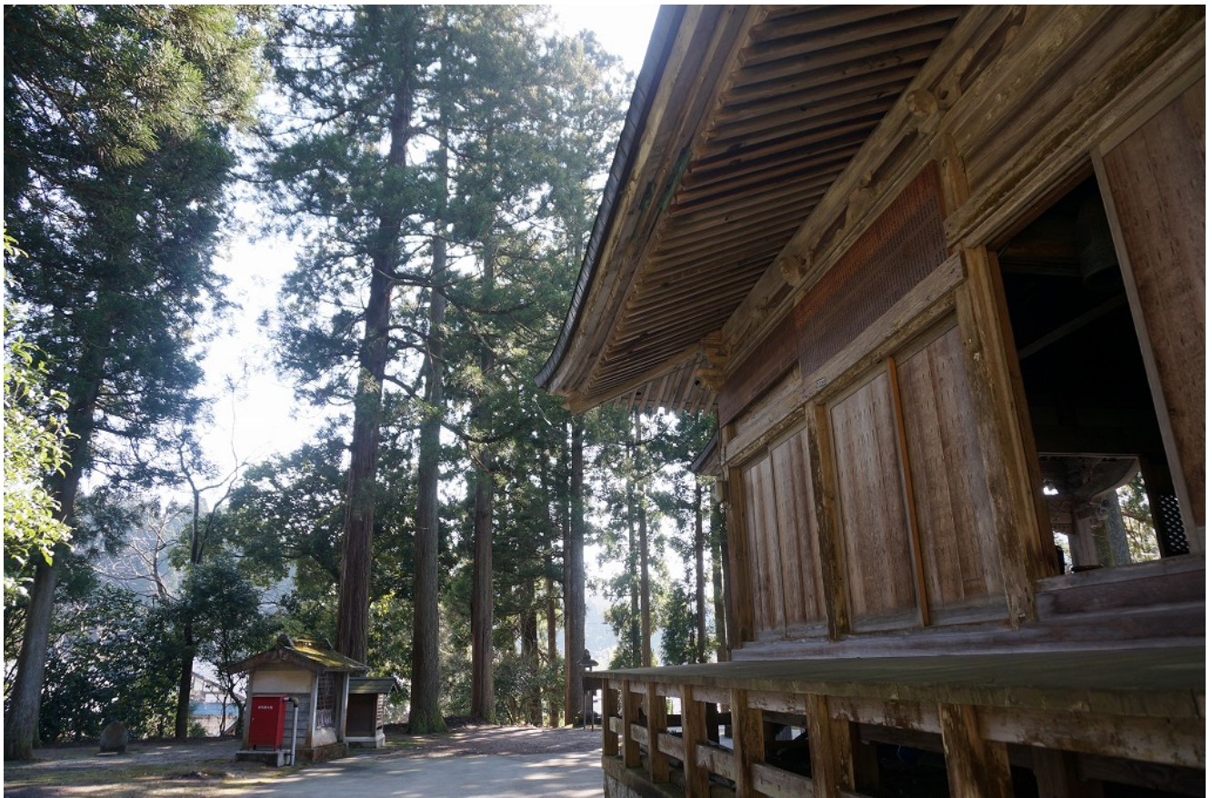
The Kannondo 神農道