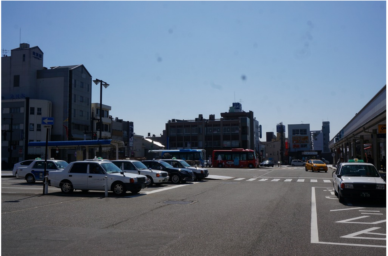
front of Uozu station