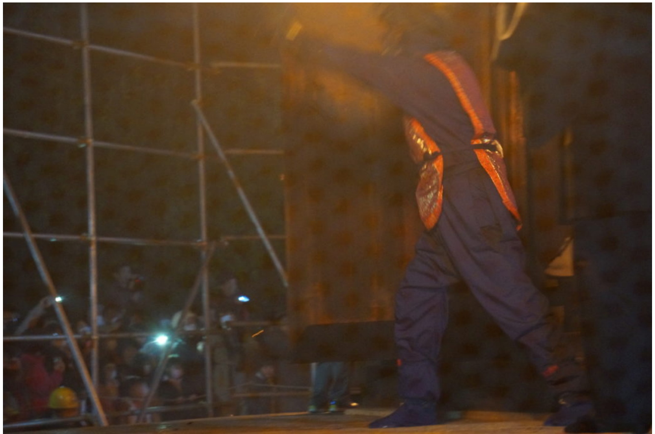
\square When the sparks spread, people cheered. Sometimes, a torch