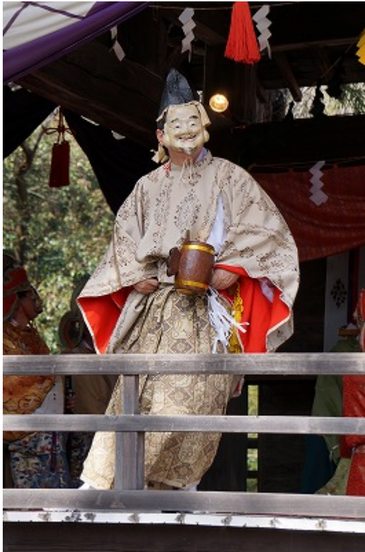
Ebisu, a deity of fortune