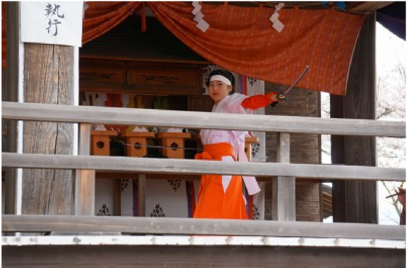
□ "Four swords men"