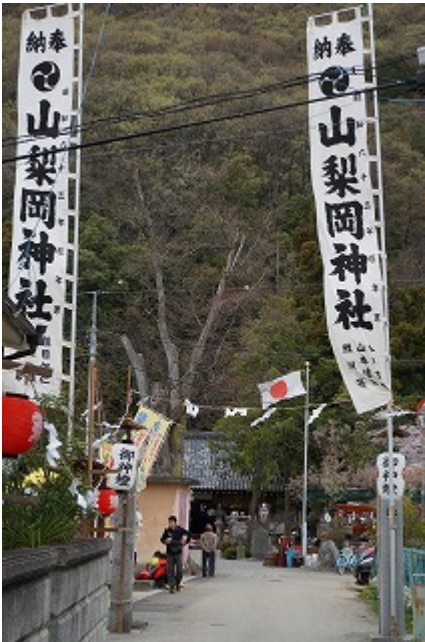
flags tells the festival