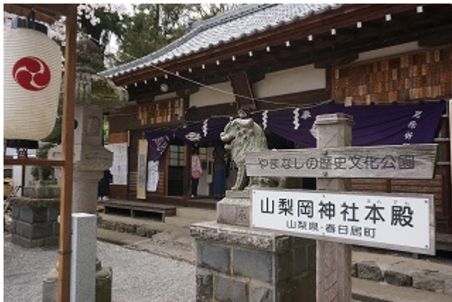
the Hon-den of the shrine