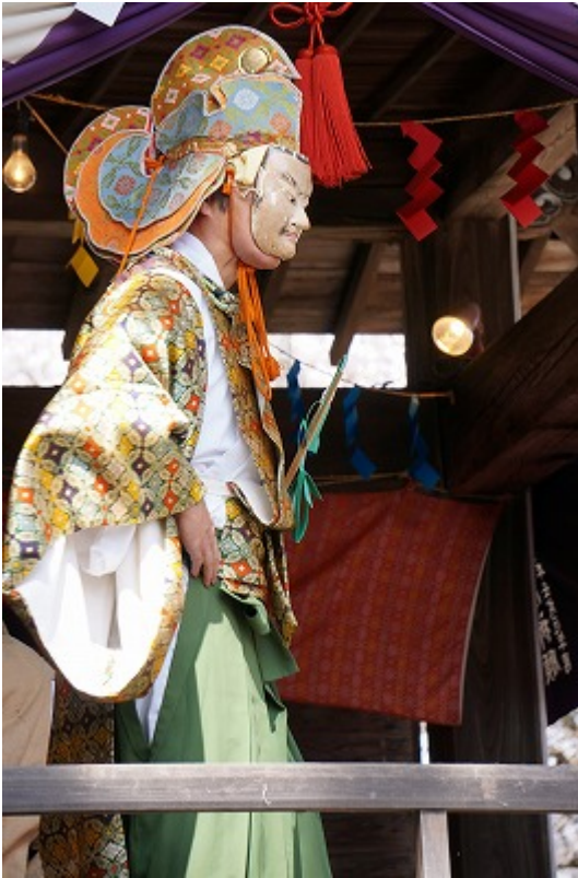
a deity of battle

Many deities come in, so we can watch dances of deities who don't perform their own programs today.