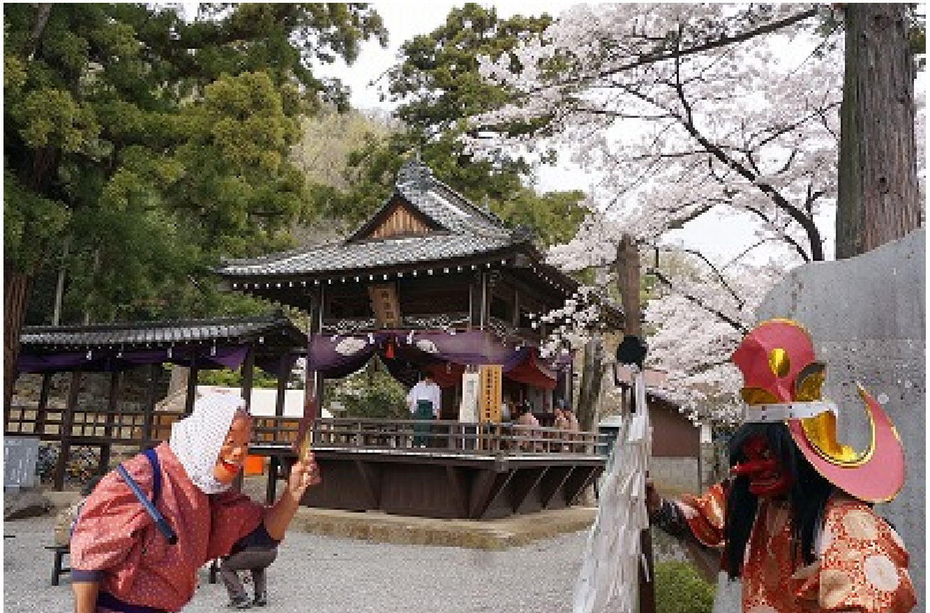
Sarutahiko and Modoki visit the shrine