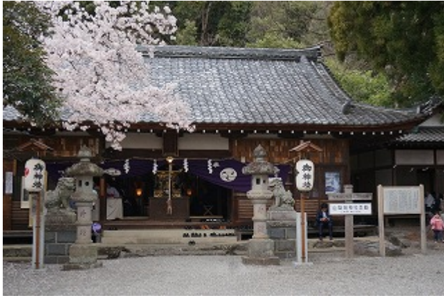
the Hon-den 本殿