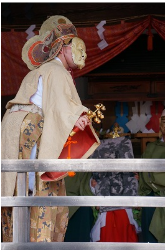
a deity of agriculture