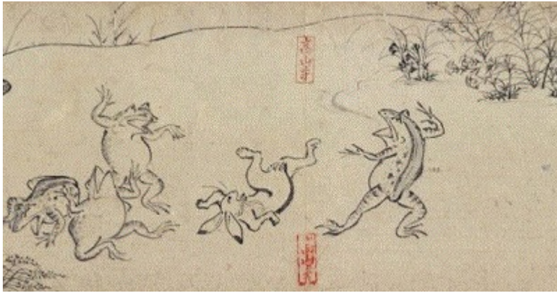
a part of “Choju-Jinbutsu-Giga”