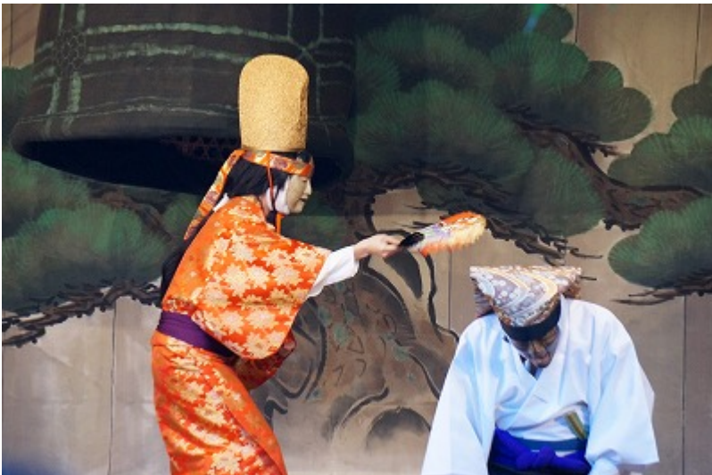
and beautiful sounds