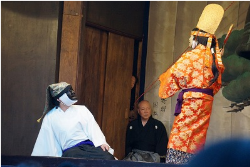
She began to dance