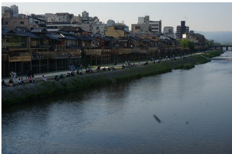
the Kamo river

*This article is written based on writer's experience at 4th, May, in 2018 and a booklet.