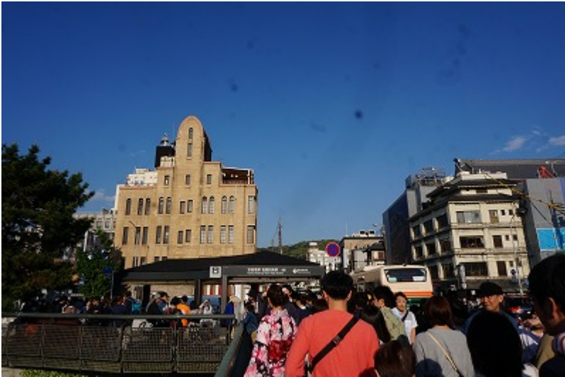
the center of Kyoto city

There is the Kamo river. It always makes me feel good.