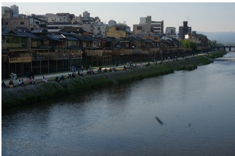
the Kamo river

*This article is written based on writer's experience at 4th, May, in 2018 and a booklet.