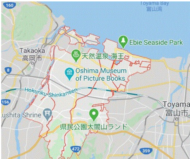
Imizu city 〇〇〇