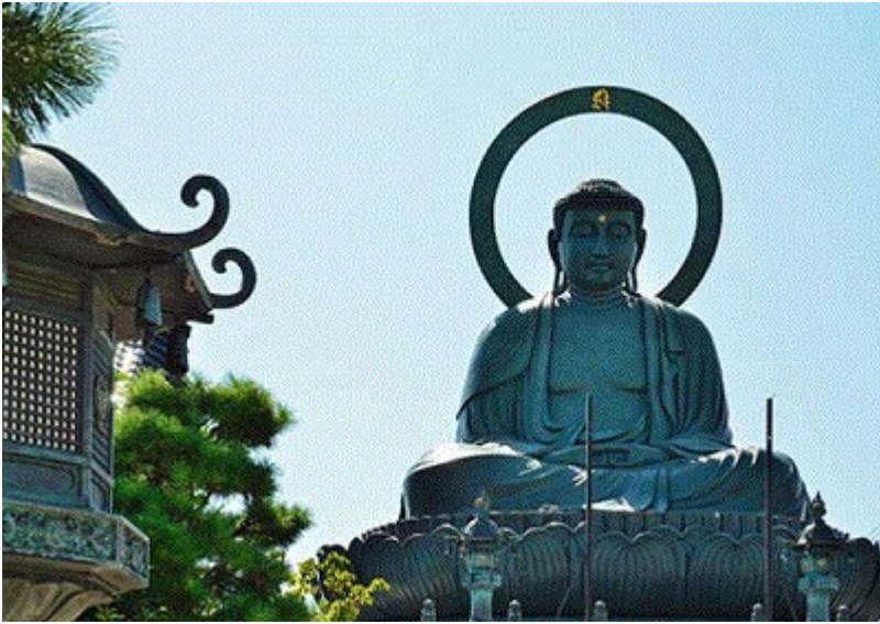
Takaoka great buddha