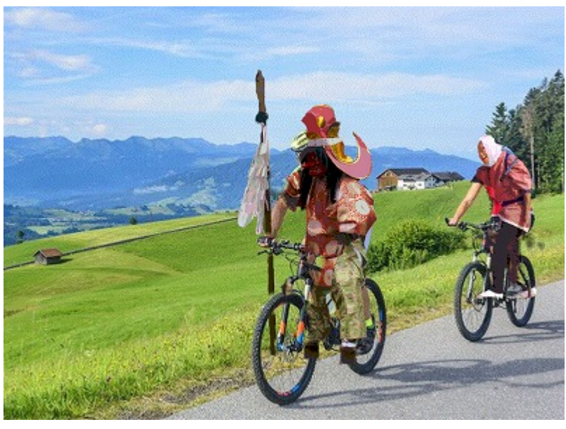
The photo is an image.