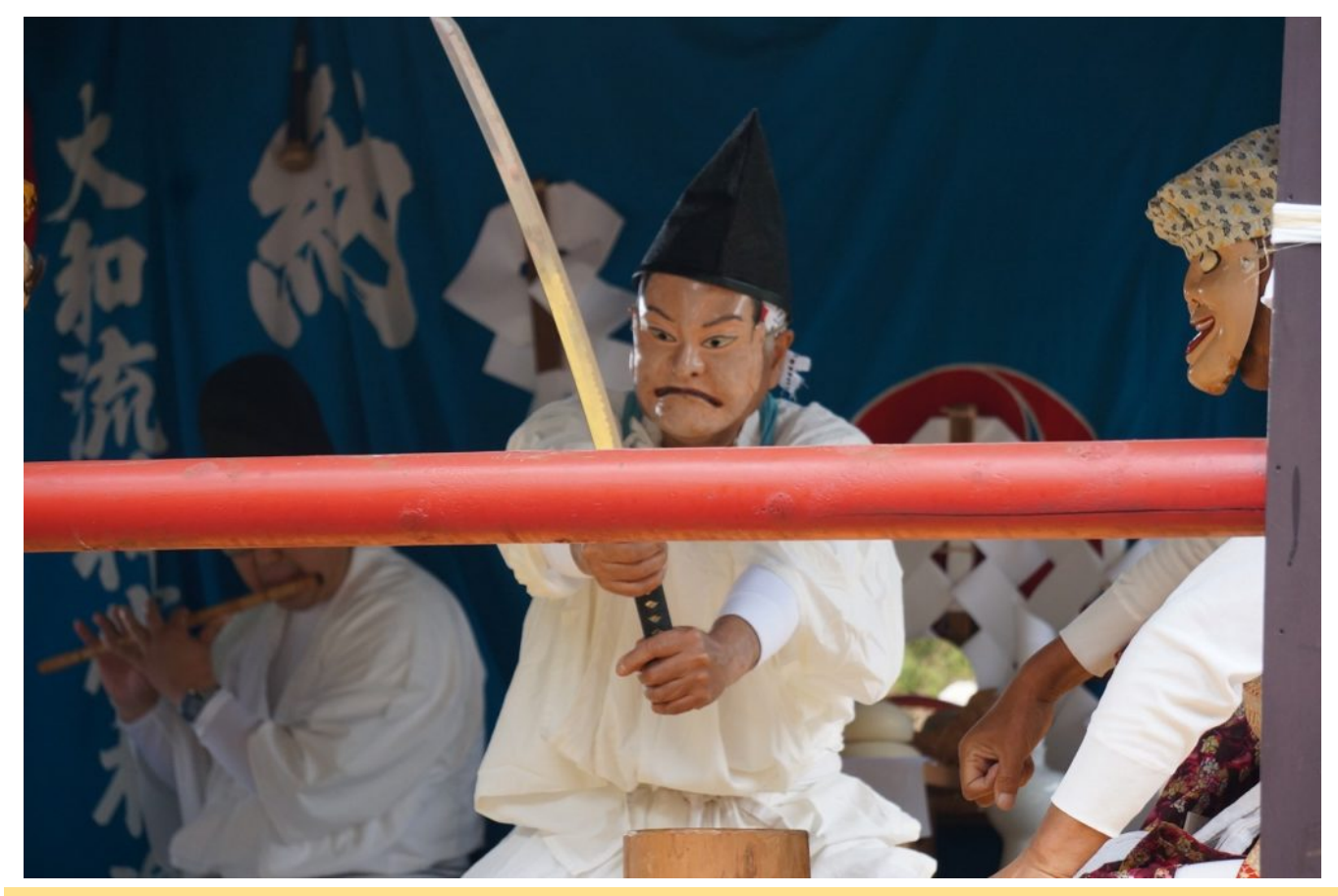
Yeah, it turned out pretty well.