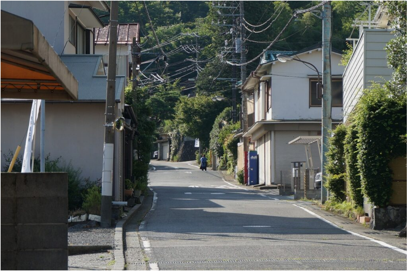
way to shrine