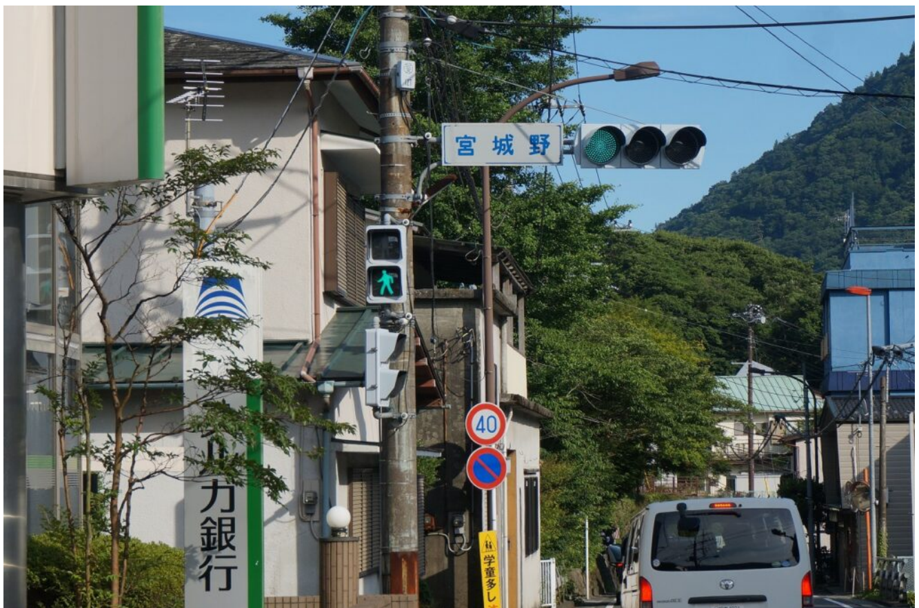
around the bus stop

□This time, I took a bus from Odawara. Odawara was not only the gateway to Hakone, but also a stronghold of the feudal lords who once ruled the Kanto region, and you can see the castle from the station (although it is a restored one). However, most surprisingly, almost all the passengers were tourists from overseas. There were only a couple of Japanese passengers, and all the passengers on the bus spoke English and French. We Japanese felt small. The bus enters the mountain road halfway up the winding road. When you get off the bus, there are banners announcing the Shishimai everywhere, so it's easy to find your way. After passing through a residential area, you walk up a gentle slope for about ten minutes. When you see a bridge with a red railing, the shrine is just around the corner. There are two paths, called Otoko-zaka (the slope for men) and Onna-zaka (the slope for women) respectively. The slope for men is steeper and the slope for women is gentler, but either way, the climb is inevitable.