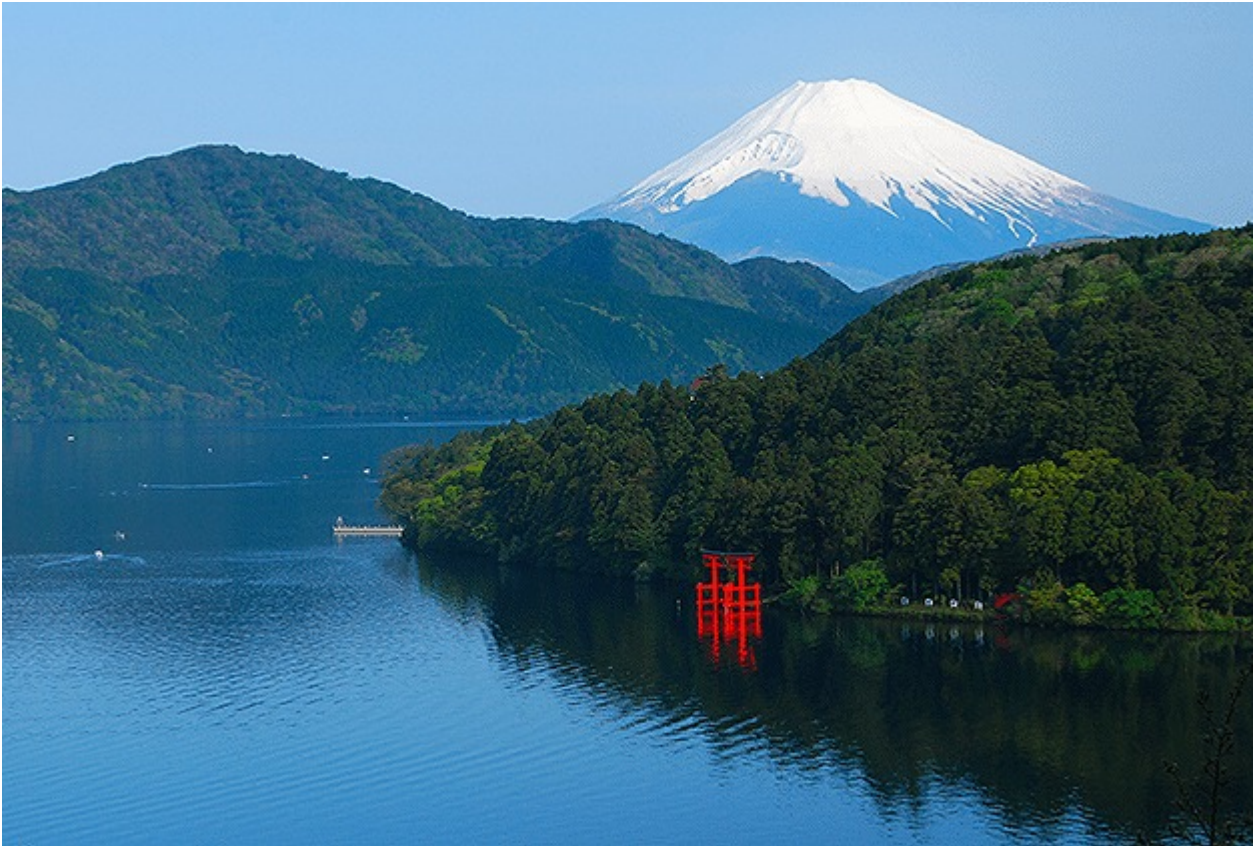
Hakone (from Ashino lake to Mt.Fuji)