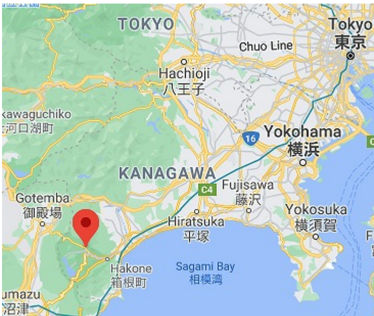
Miyagino Suwa shrine

□ In Japan, there is a tourist route known as the Golden Route that connects Tokyo, Hakone, Mt. Fuji, Nagoya, Kyoto and Osaka.