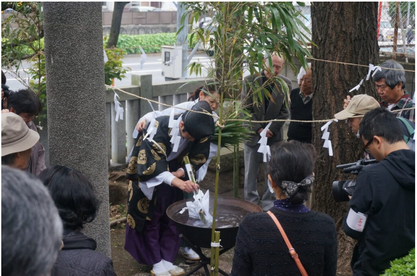
“Yutate” Shinto ritual

junior high schools from neighboring areas. It is also one of the most important stations on the Tokaido 東海道 Highway, connecting Tokyo and Kyoto. The Tokugawa Shogunate, which was based in Edo (present-day Tokyo), designated Hakone as the final defense point to stop enemies attacking from the west, and it was also famous for the rigid checkpoint. However, even in such Hakone, lion dances are quietly preserved: at Sengokuhara (参国原) in March, at Kintoki (金時) Shrine in May, and at Miyagino (宮内) in July.