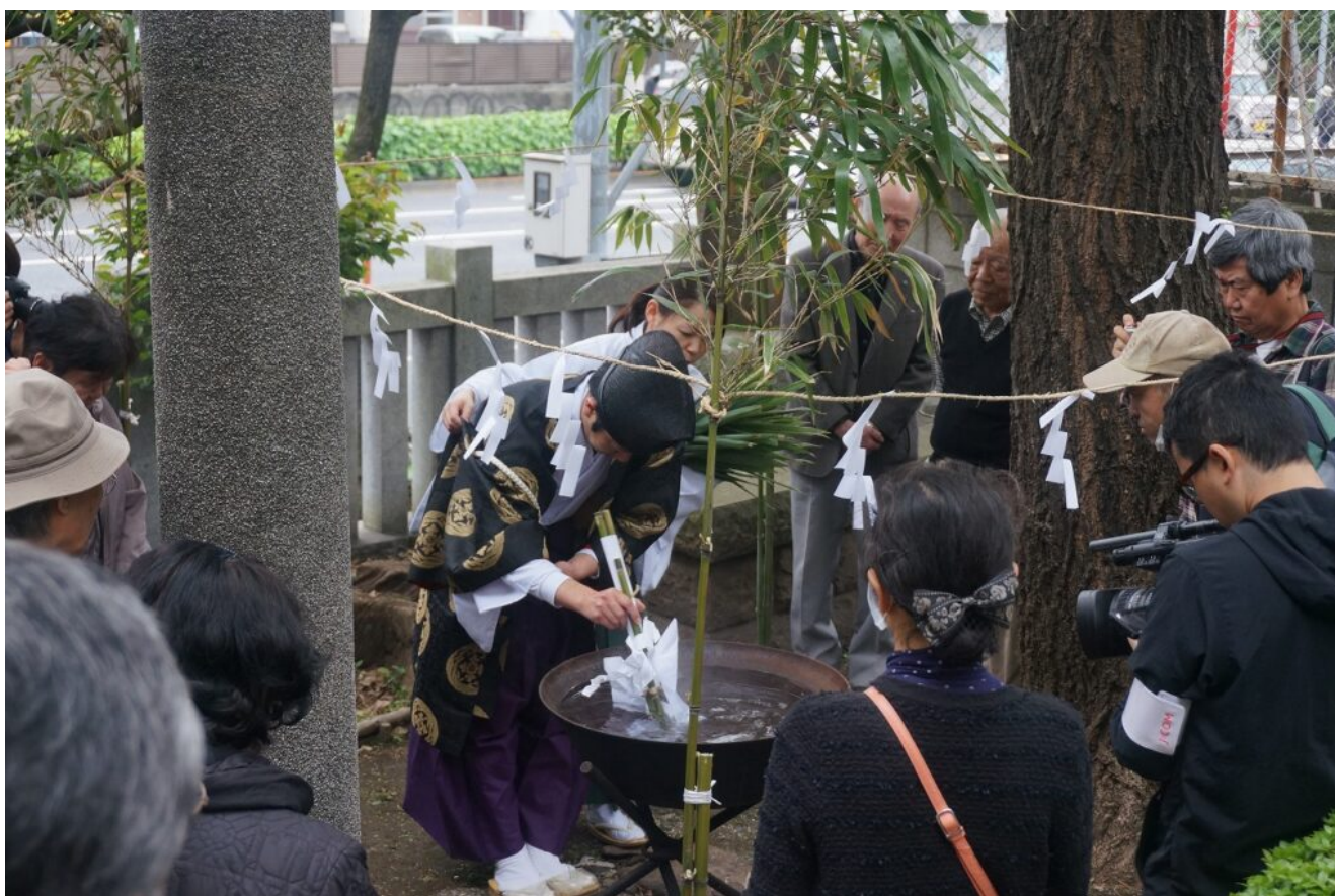
“Yutate” Shinto ritual

junior high schools from neighboring areas. It is also one of the most important stations on the Tokaido 東海道 Highway, connecting Tokyo and Kyoto. The Tokugawa Shogunate, which was based in Edo (present-day Tokyo), designated Hakone as the final defense point to stop enemies attacking from the west, and it was also famous for the rigid checkpoint. However, even in such Hakone, lion dances are quietly preserved: at Sengokuhara (箱根) in March, at Kintoki (金時) Shrine in May, and at Miyagino (宮野) in July.