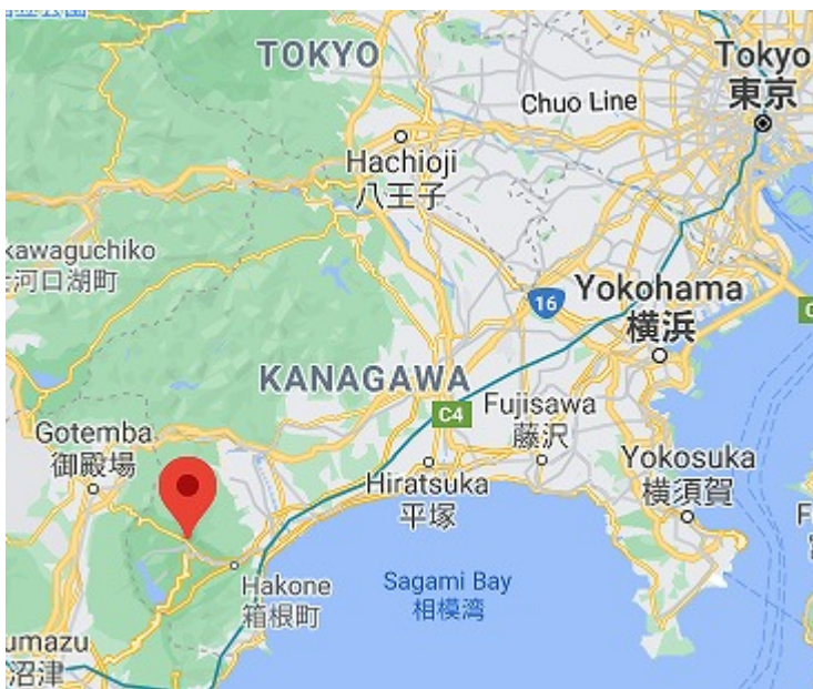
Miyagino Suwa shrine

□In Japan, there is a tourist route known as the Golden Route that connects Tokyo, Hakone, Mt. Fuji, Nagoya, Kyoto and Osaka.