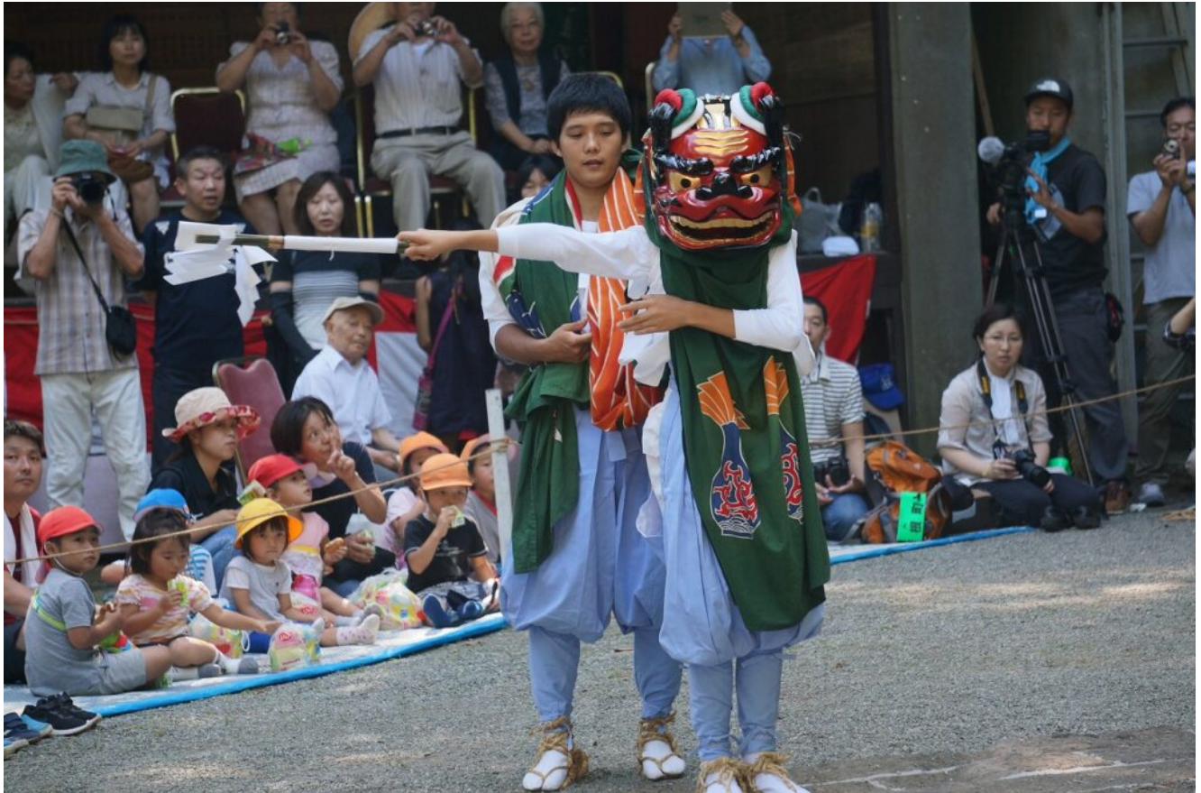
Shishi (lion) walks holding “Gohei”