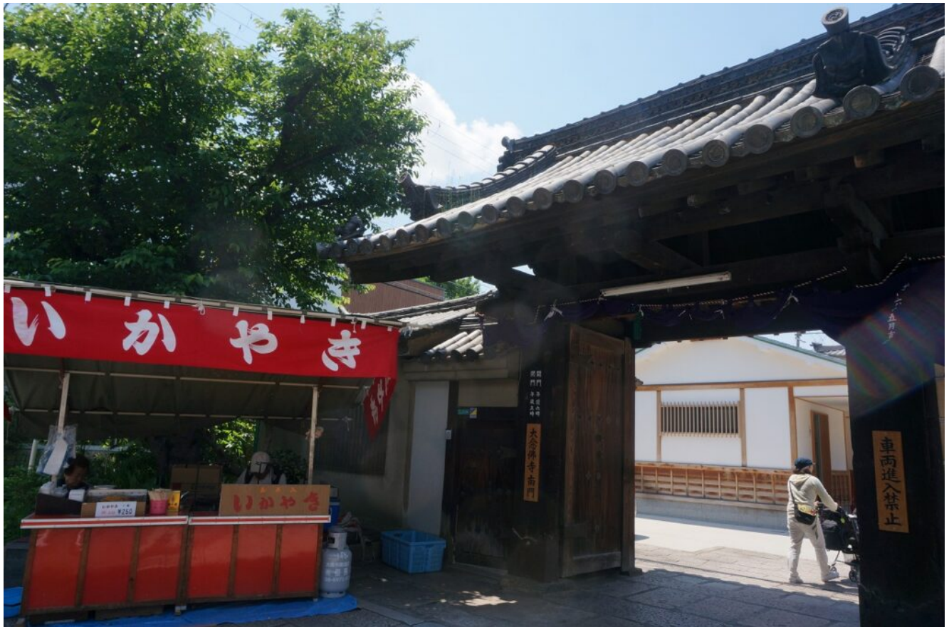
a sub gate