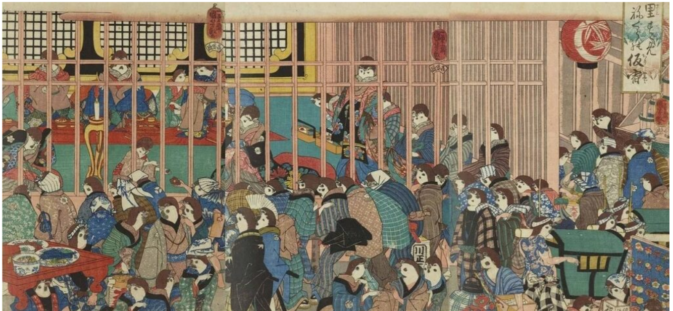
"Satosuzume negurano kariyado 雀の初合 里子屋" by Utagawa Kuniyoshi (1798~1861) https://www.fujibi.or.jp/en/our-collection/profile-of-works.html?work_id=9737 https://otakinen-museum.note.jp/n/na972c0728883