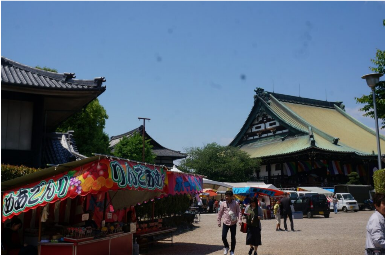
the precinct of the temple