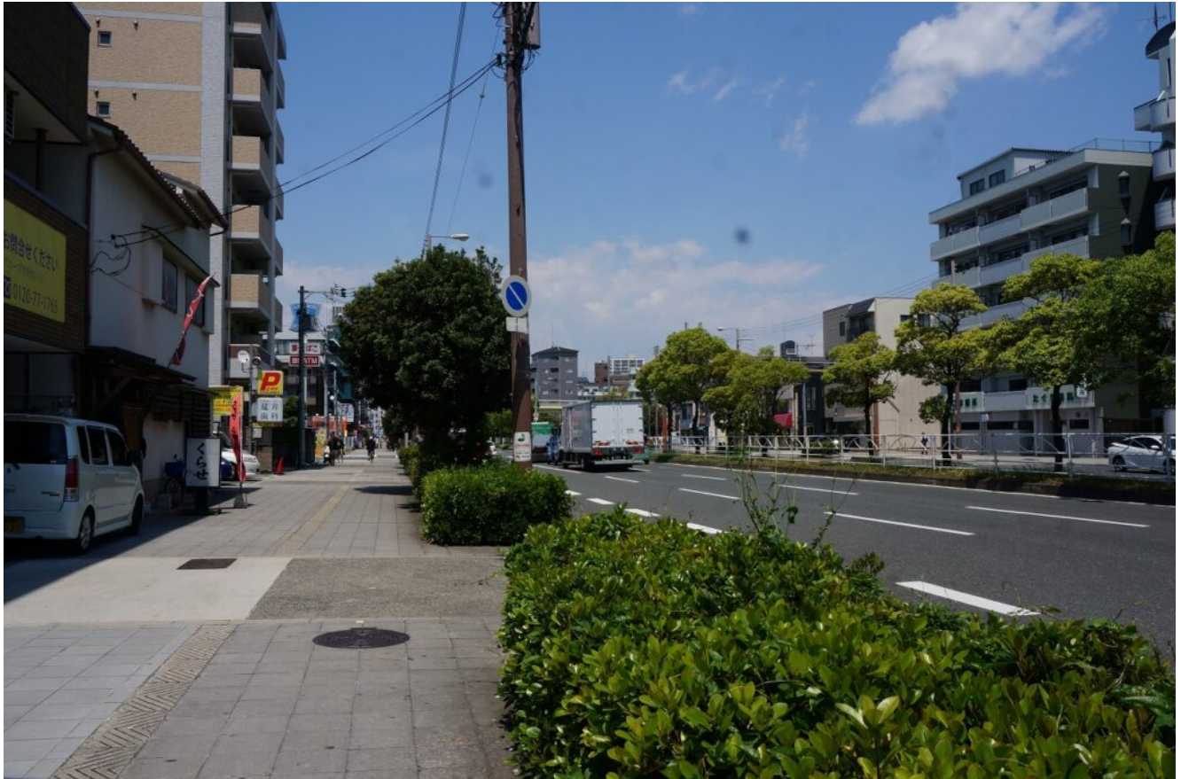
actual scene around the temple

Source: "Suzume-no Kotota (sparrow Kotota's story) 〇〇〇〇〇" (16C) cf: https://www.suntory.co.jp/sma/collection/data/detail?id=635