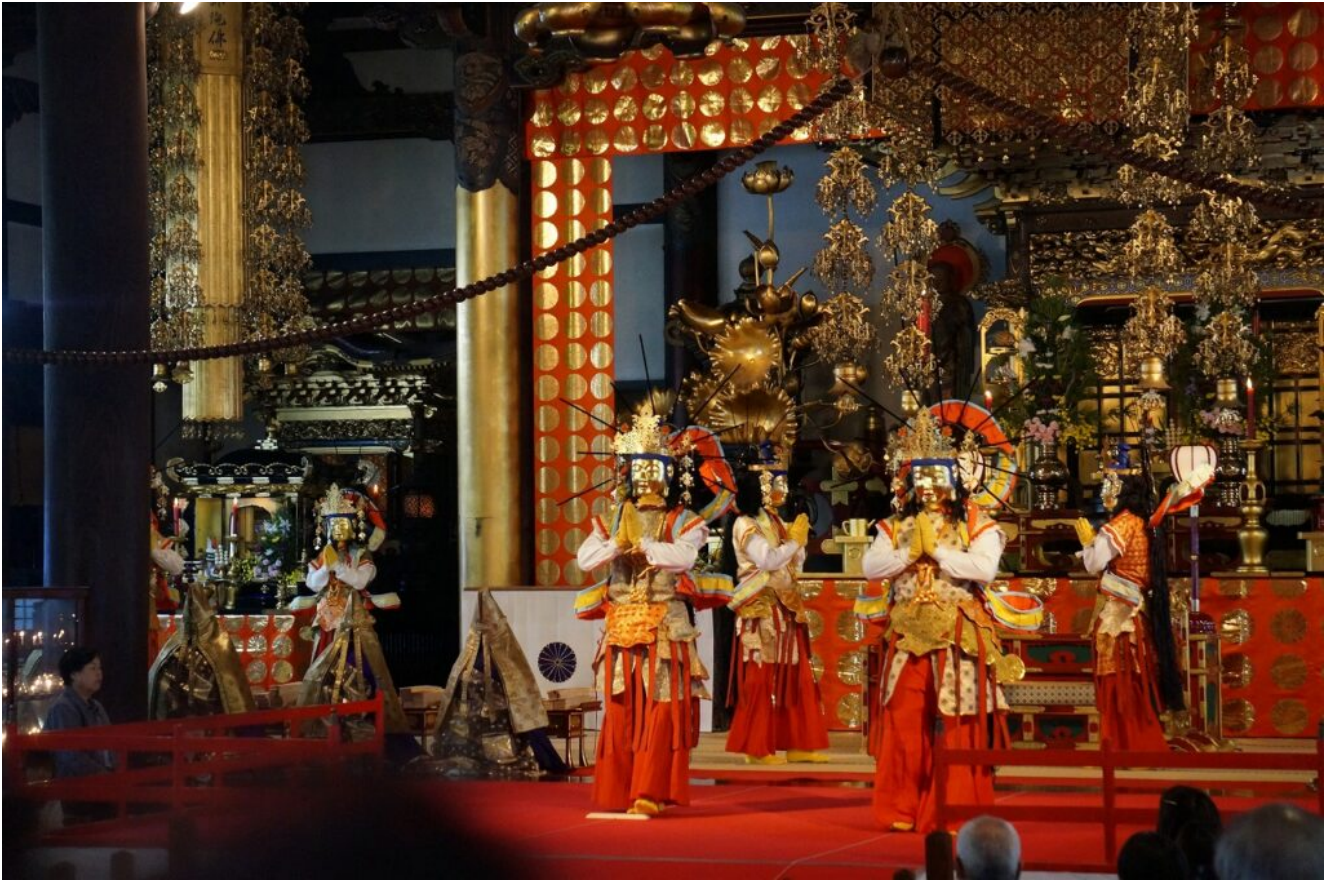
Here emerged a scene of the Buddhist paradise that the people long ago had imagined.