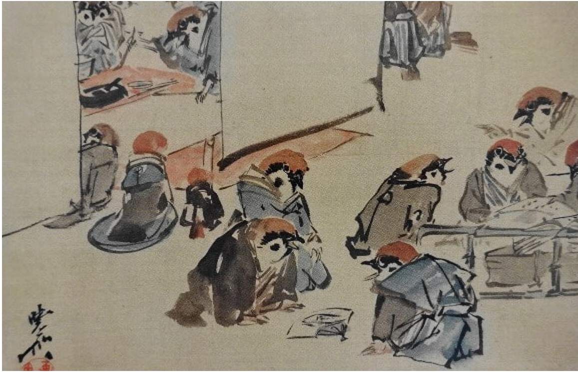
"Suzume no shogakai 雀の初合" by Kawanabe Kyosai 河内清酒 (1831~1889) https://tokyo.digi-joho.com/attractions/arts-culture/7-kawanabe-kyosai-museum.html