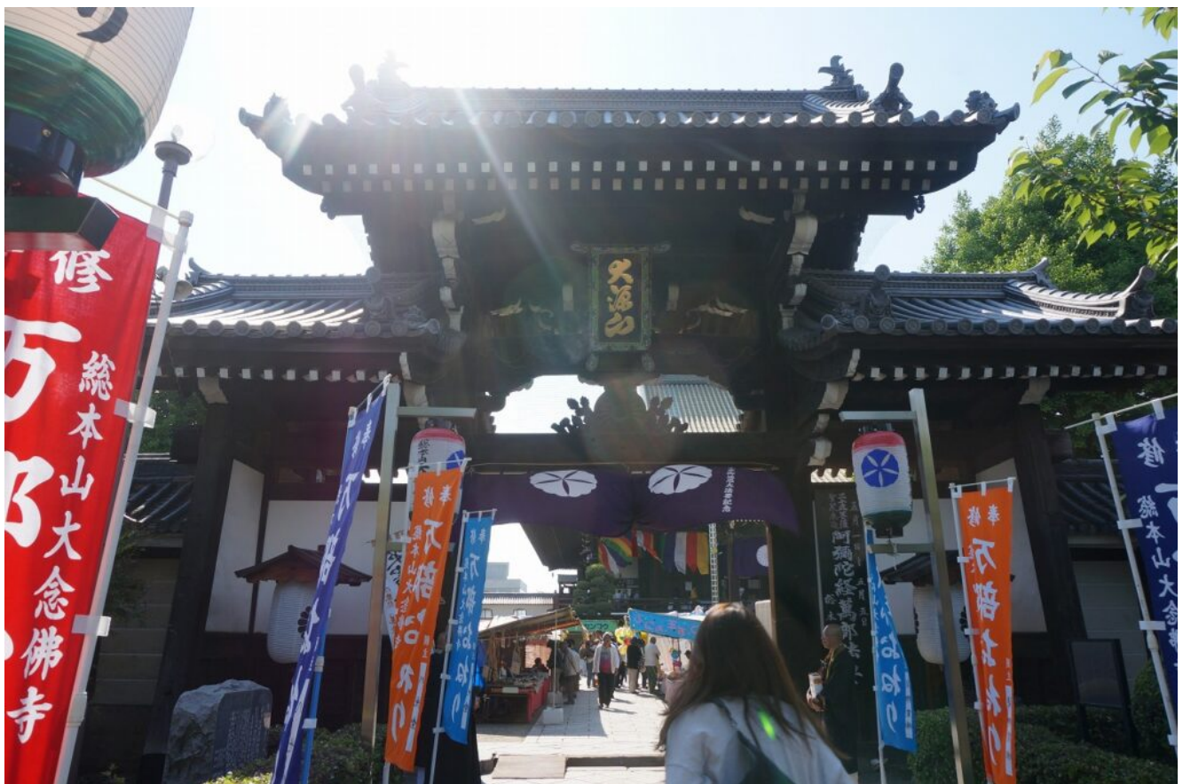
the main gate