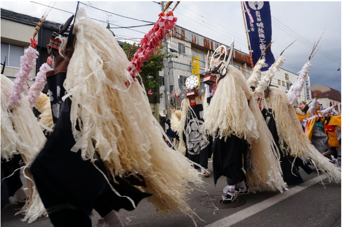
Wow, here it comes. They seem to spring up from behind me.