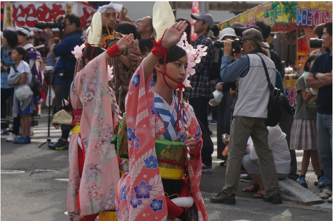
Sansa Odori and Nanbu Odori, right? The Sansa dance is based