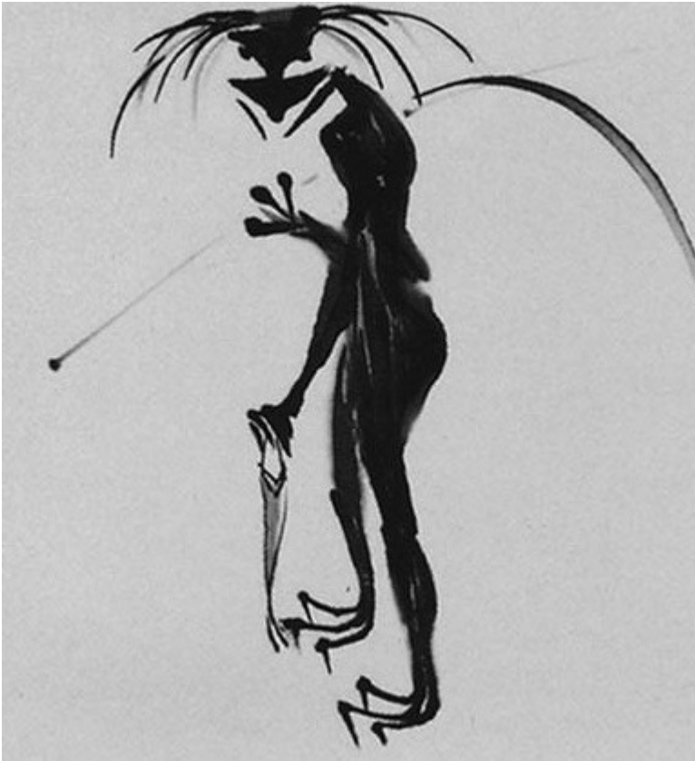
Written by Akutagawa (famous novelist)