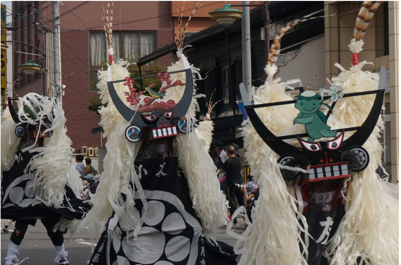
Finally, a large group of Shishi arrive. All roles are based