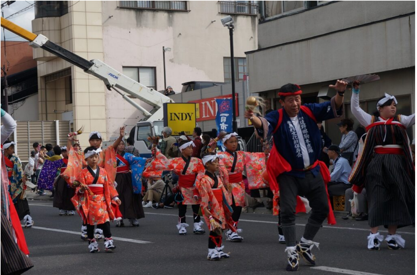
Tane-fukube and Nakataiko