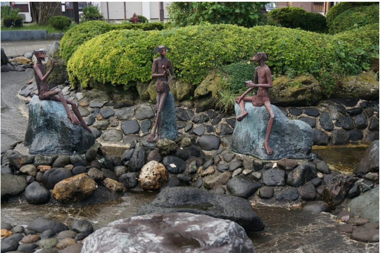
Kappa in front of the Tono station

It sounds tough. A lot of kappa friends are waiting for you, too. Take your time and enjoy yourself.