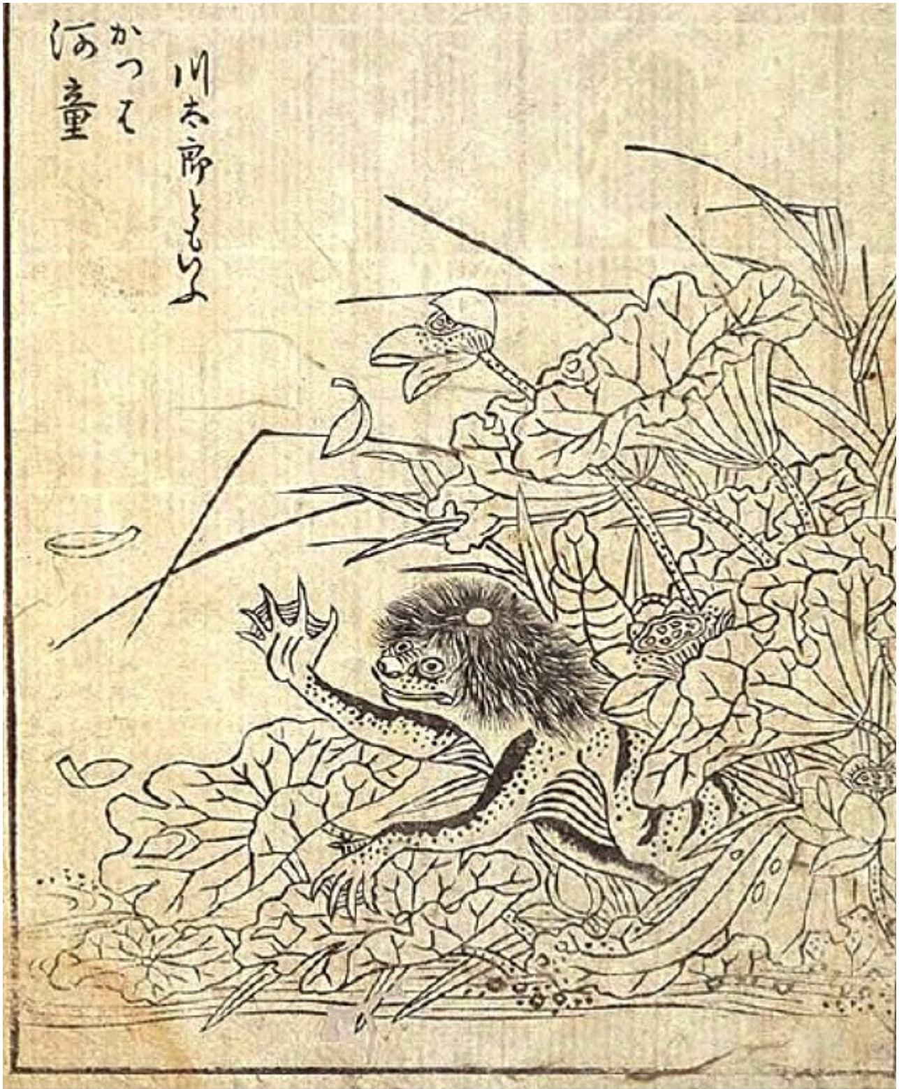
Written by Toriyama Sekien (1718~88)