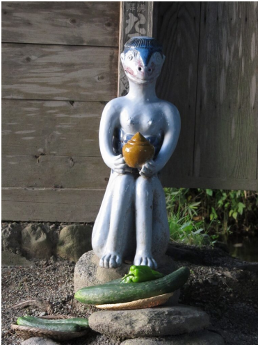
Kappa at the “Kappa pond”