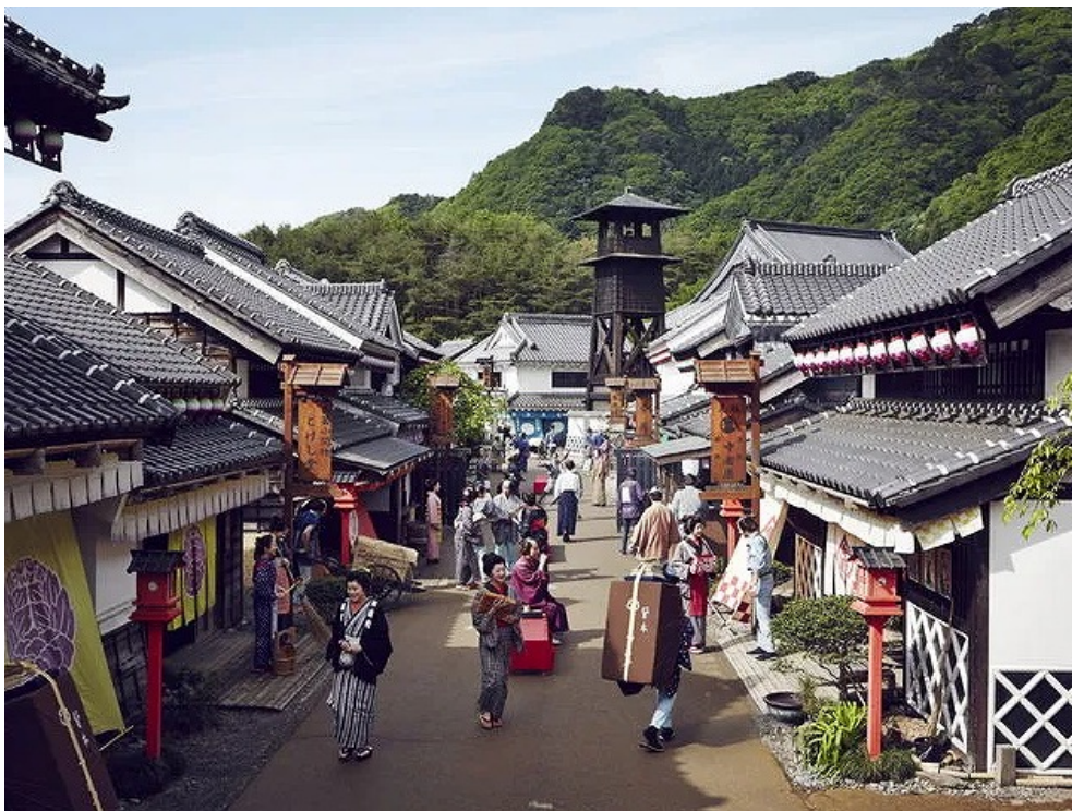
Edo Mura (Edo village) 村

https://travel.rakuten.co.jp/mytrip/ranking/spot-nikko