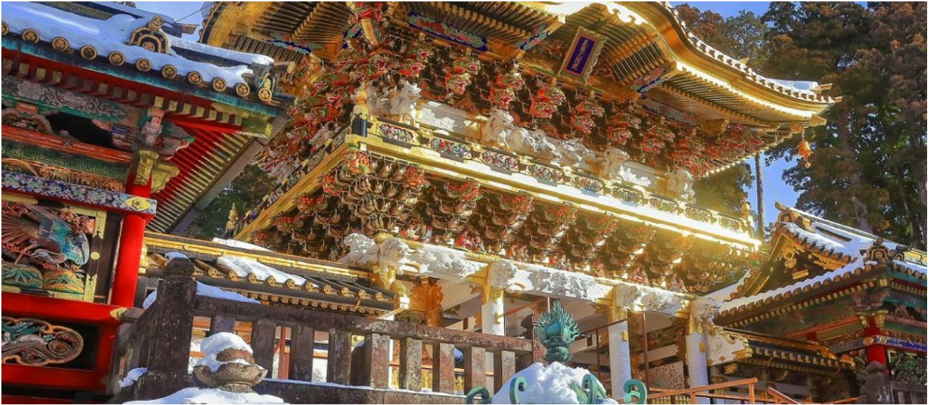
Toshogu shrine 日光

https://www.gltjp.com/ja/directory/item/10071/