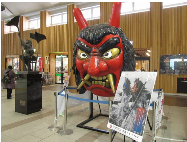
The Akita station

alongside the Akita Dog and Kanto Festival (the summer festival). It can be classified as a “visiting god” event. Like Santa Claus, he appears only at certain times of the year to bring good fortune to the people. Most of the original events take place on the night of New Year’s Eve, and since Namahage groups visit private homes, it is difficult for anyone outside of the community to see them. Therefore, as a tourist project, the festival was created in 1964 by combining the original festival of the Shinzan shrine with Namahage. This is the Sedo Festival.