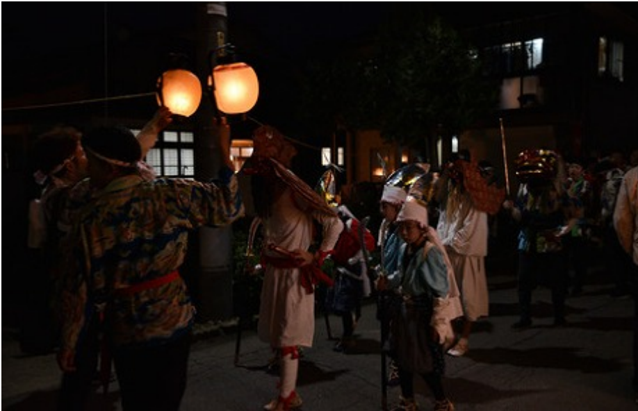
the group of the performers

http://airborn-foozin-hikarat77.blog.jp/archives/12349340.html l(A)