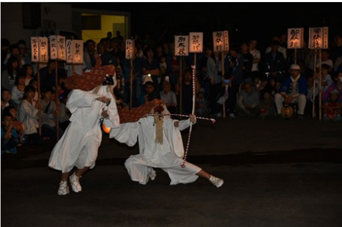
the dance of "Kotengu"

http://airborn-foozin-hikarat77.blog.jp/archives/12349340.html l(A)