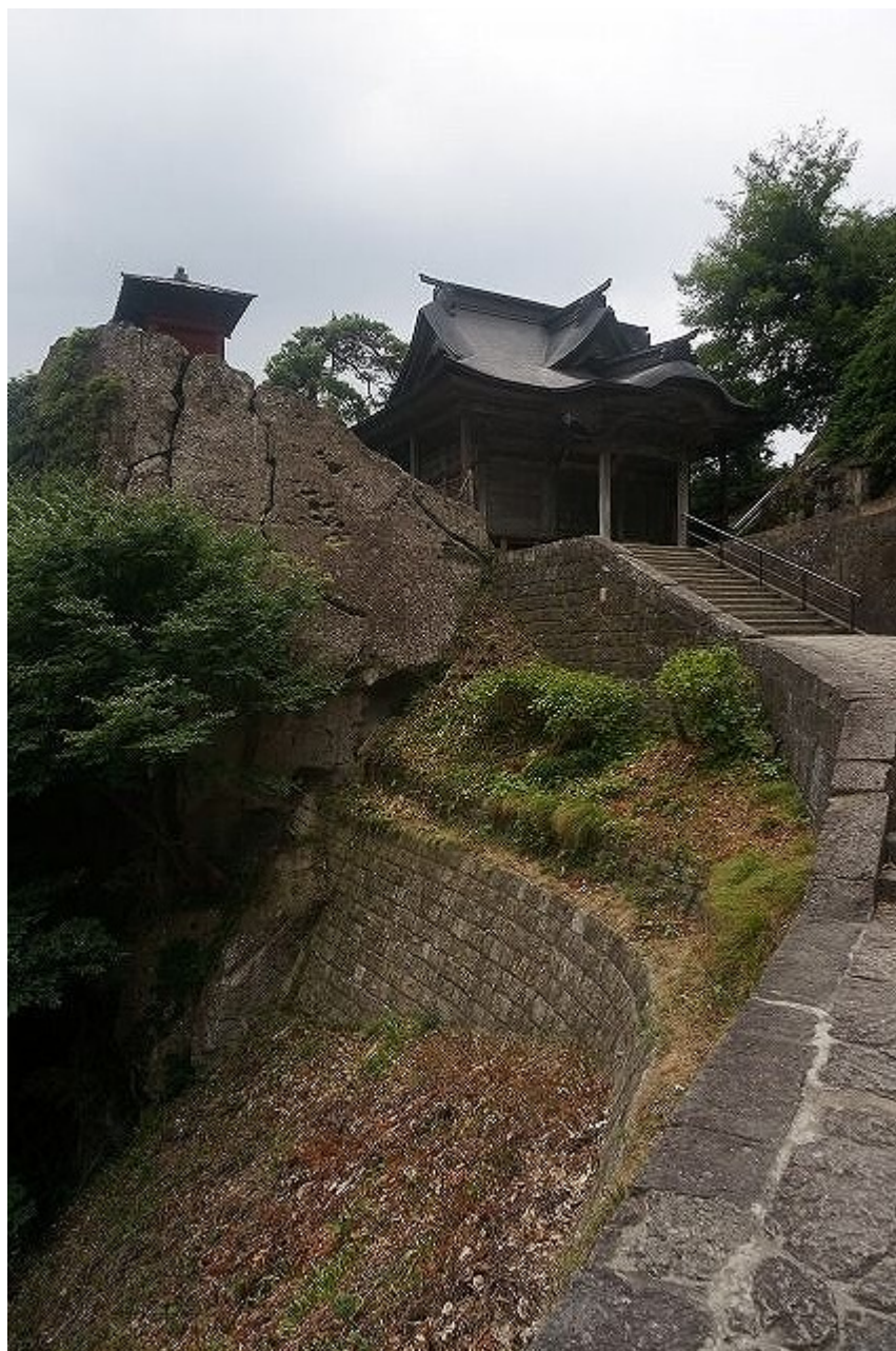
Godai-do hall 五代堂