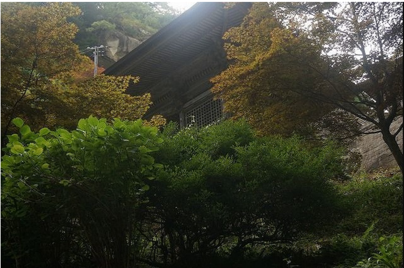
Niou-mon (Niou-gate) 二王門