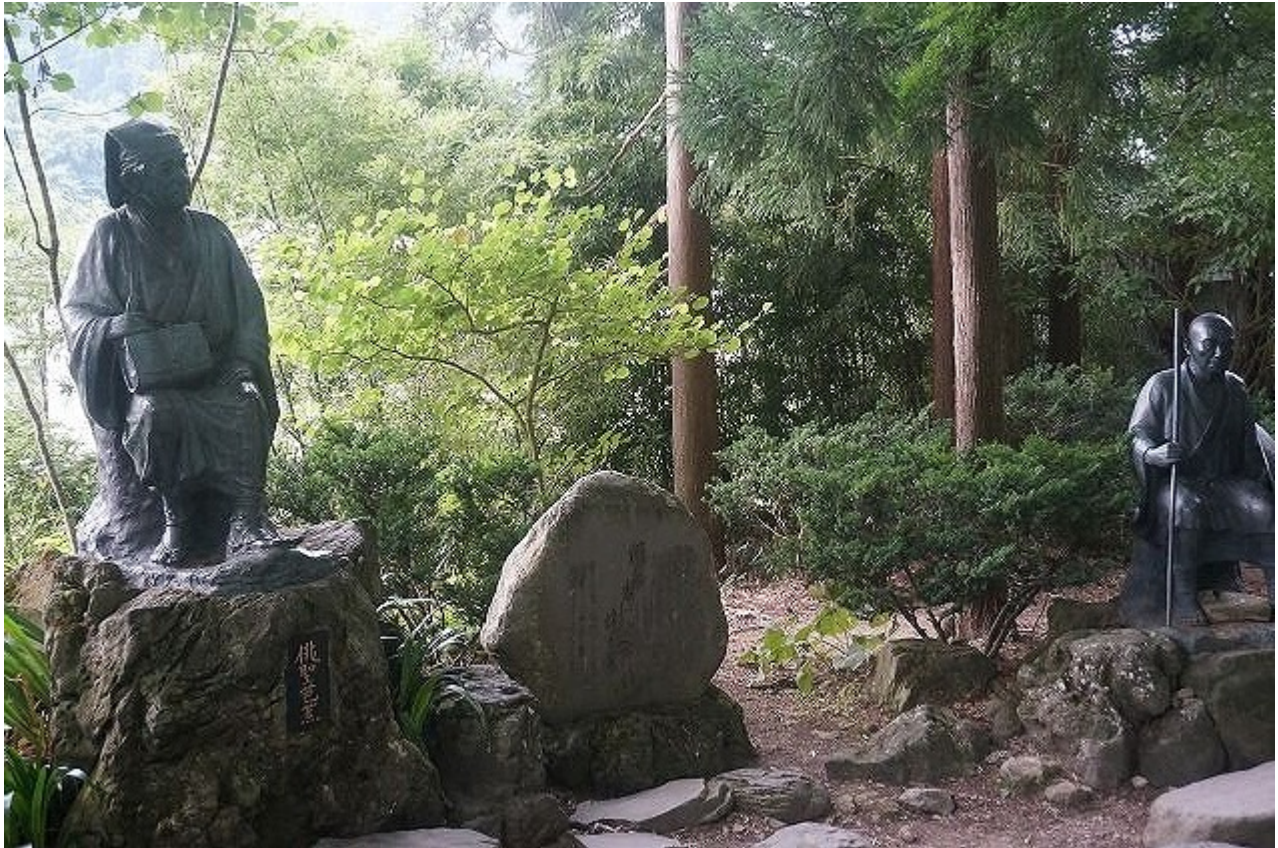
Matsuo Basho and Sora