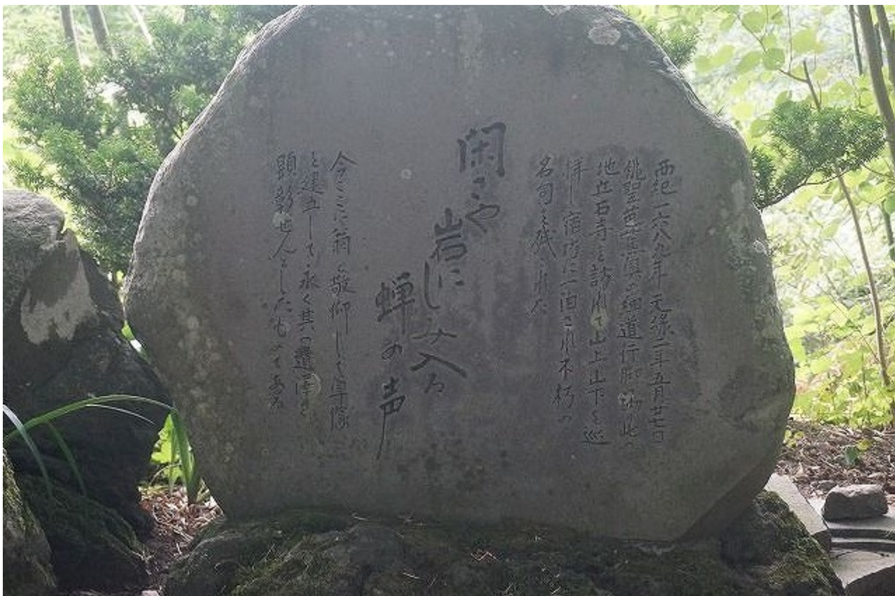
a stone tablet inscribed with a haiku

Nowadays, haiku has spread all over the world. Matsuo Basho is