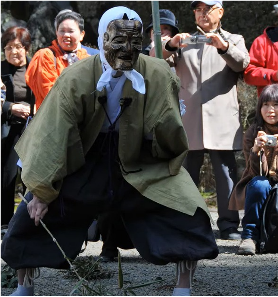
the aged husband