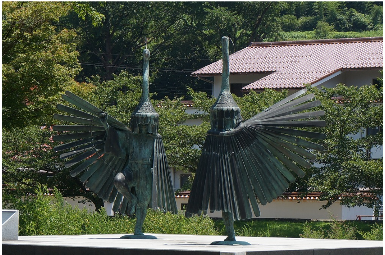
A small town in Shimane Prefecture had handed over from