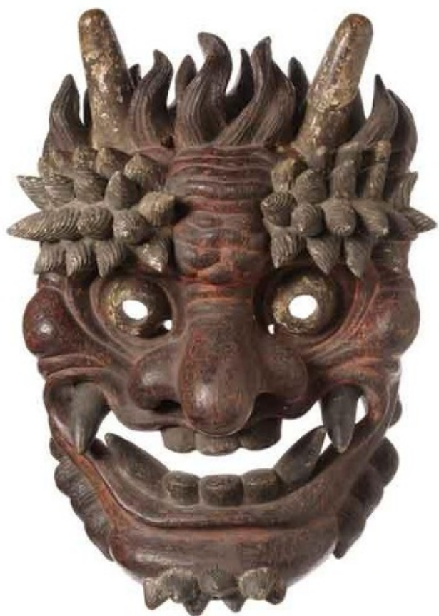
father and mother ogre