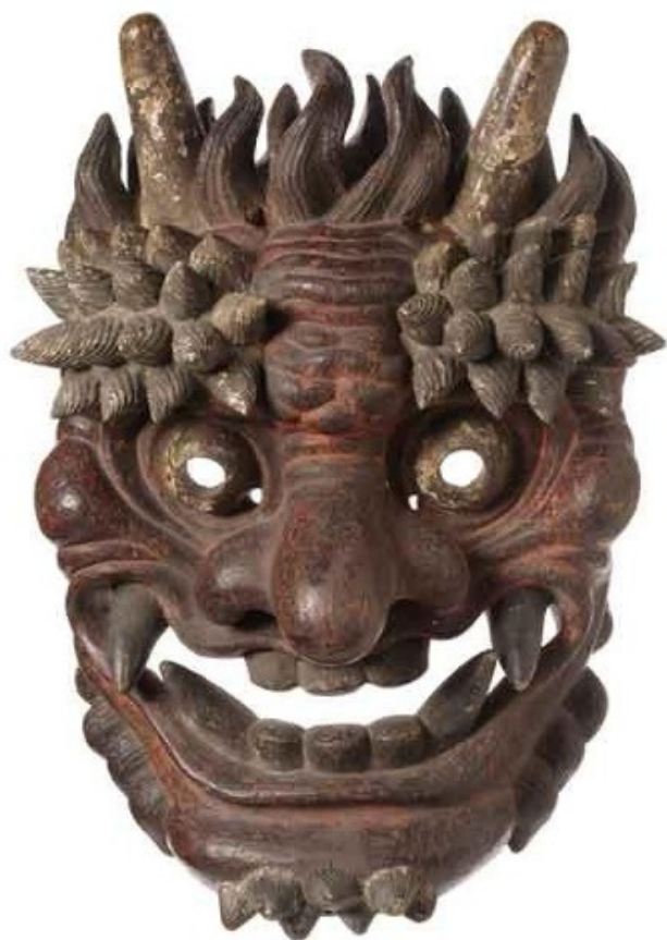
father and mother ogre