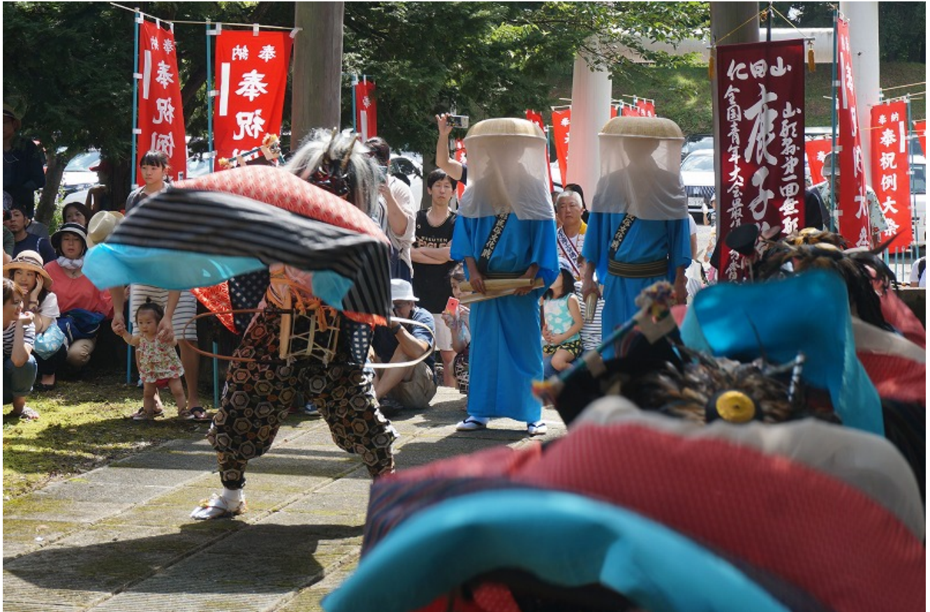
Two singers stand with umbrella-covered at the rear. They have an instrument called sasara.