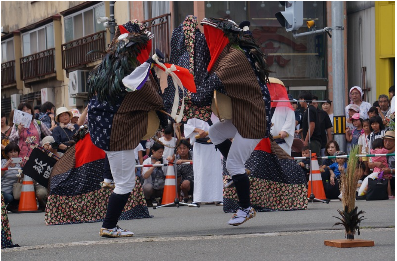
Two deer dances performed at two neighbouring shrines in the