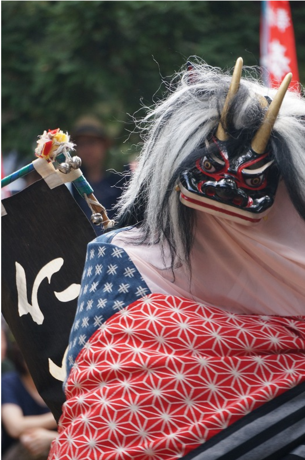
A leader of Nitayama