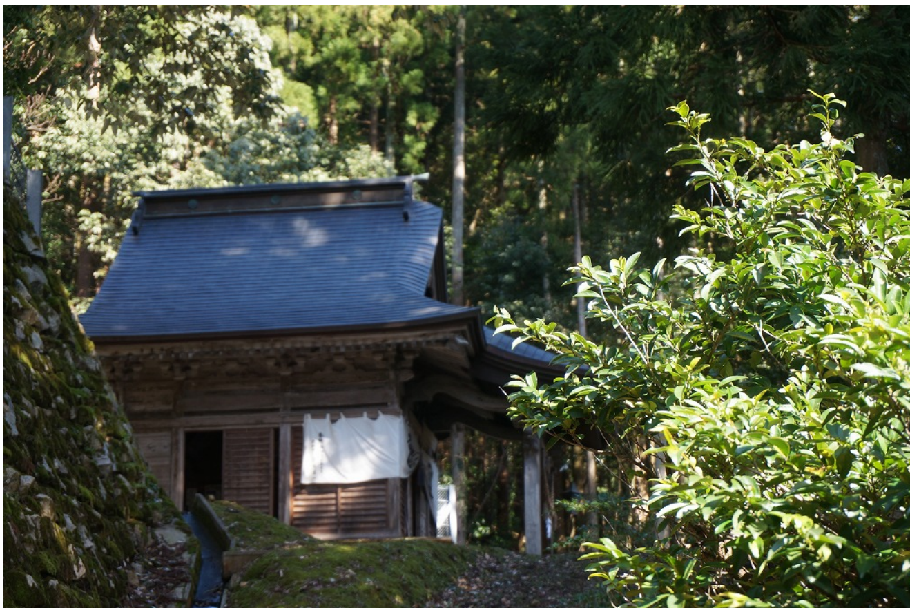
The Hakusan shrine□□□□

□I wonder, if I run some 2~30 minutes, I might finally arrive at the destination. It is the “Senko-ji temple”. There are steps for the “Kannon-do hall” right next to the building.