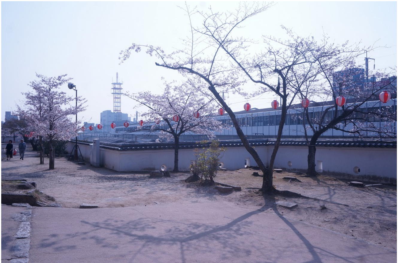
The station is in front of the castle.