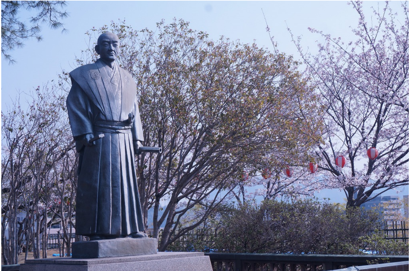
Statue of the first lord of the domain