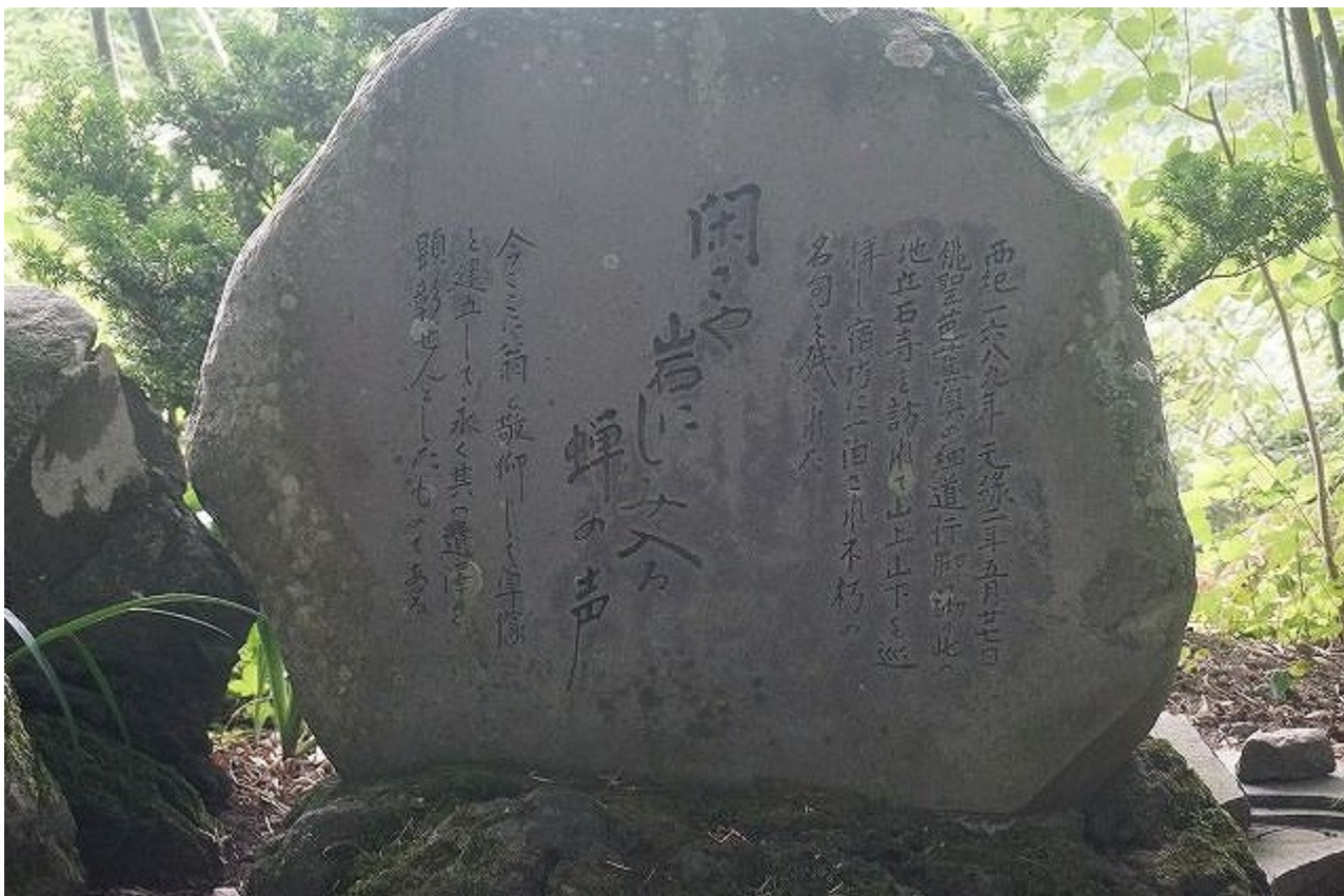
a stone tablet inscribed with a haiku

Nowadays, haiku has spread all over the world. Matsuo Basho is