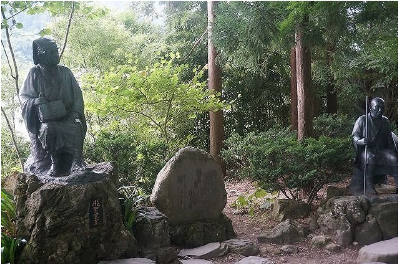
Matsuo Basho and Sora