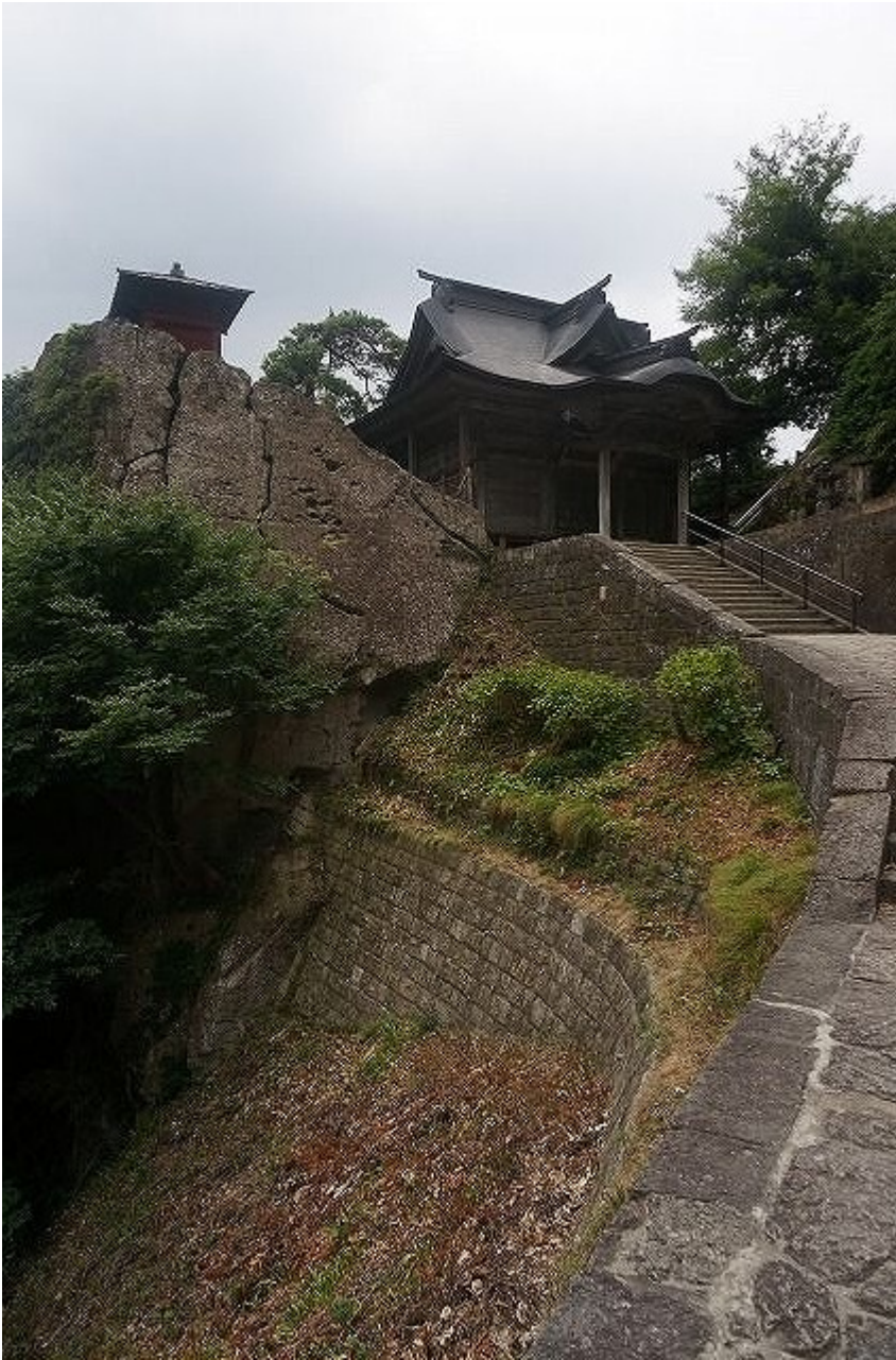
Godai-do hall 五代堂