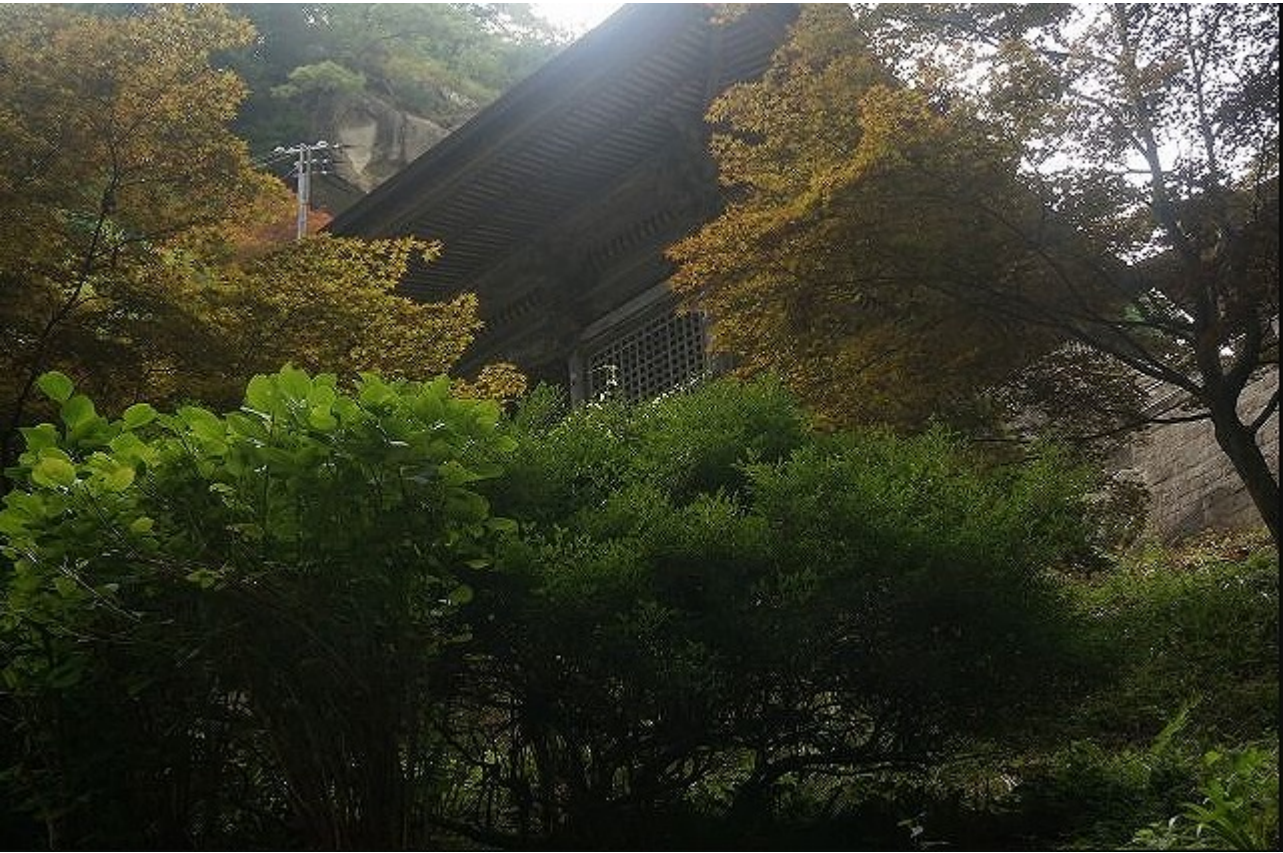
Niou-mon (Niou-gate) 二王門