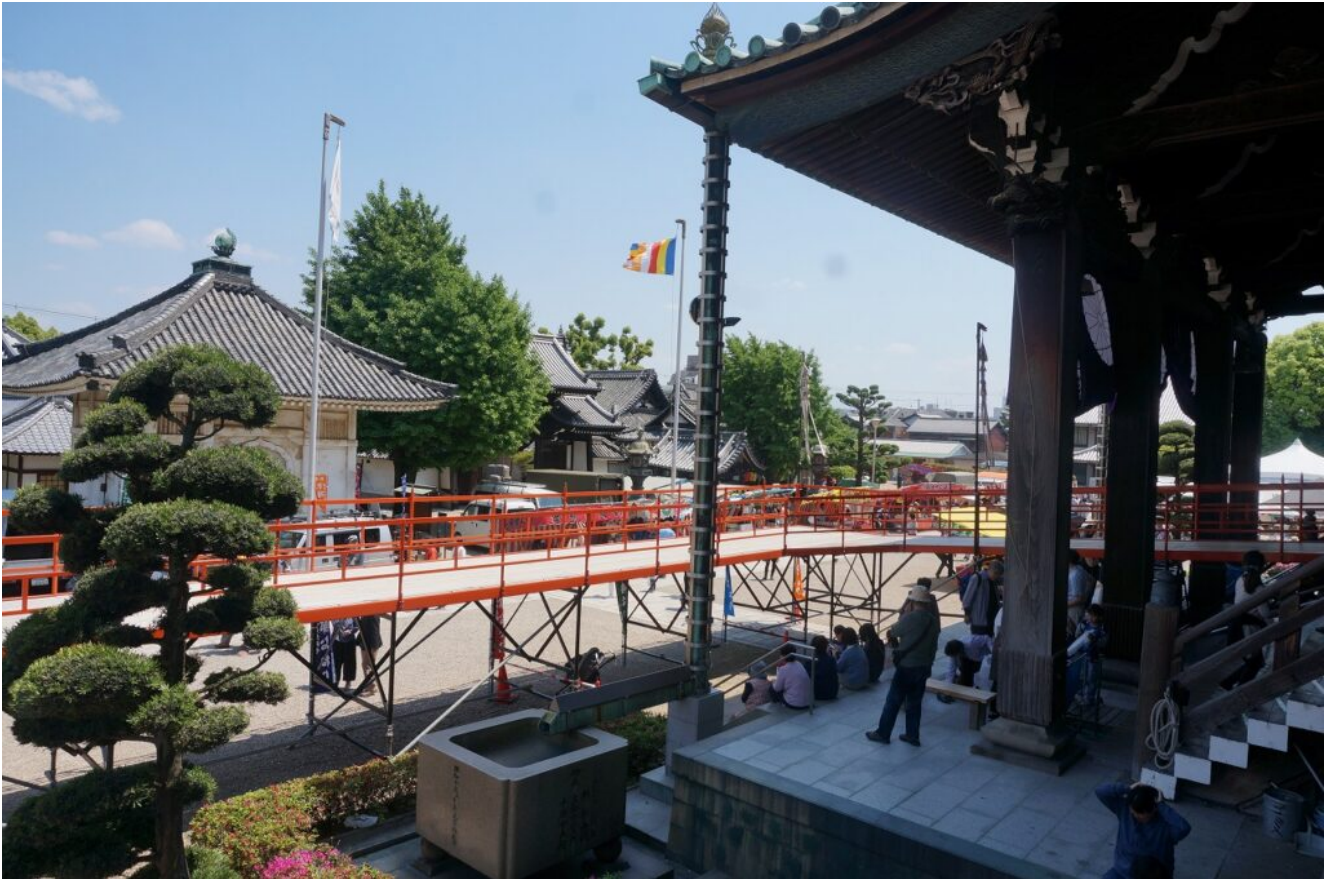
the entrance of the main hall

Excuse me, I'd like to stay here for a moment.